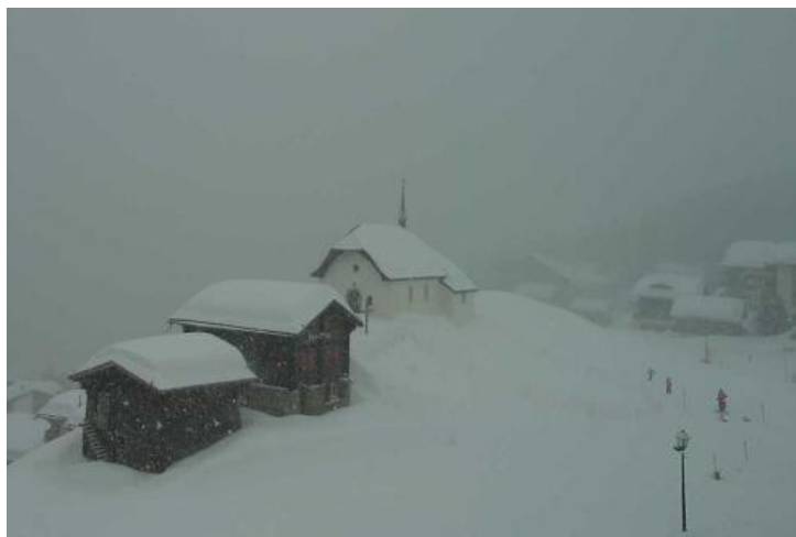
Heavy snow in Bettmeralp this afternoon - 13 February 2020 - Photo: bettmeralp.ch