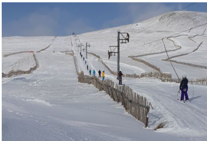
Great conditions in Glenshee today - 13 February 2020 - Photo: winterhighland.com

There is also plenty of good skiing on offer in Scandinavia, where Norway's Voss has 90/190cm depending on altitude, with some serious snow in the forecast for next week. Sweden's Åre is also in good shape with 80/100cm depending on altitude.