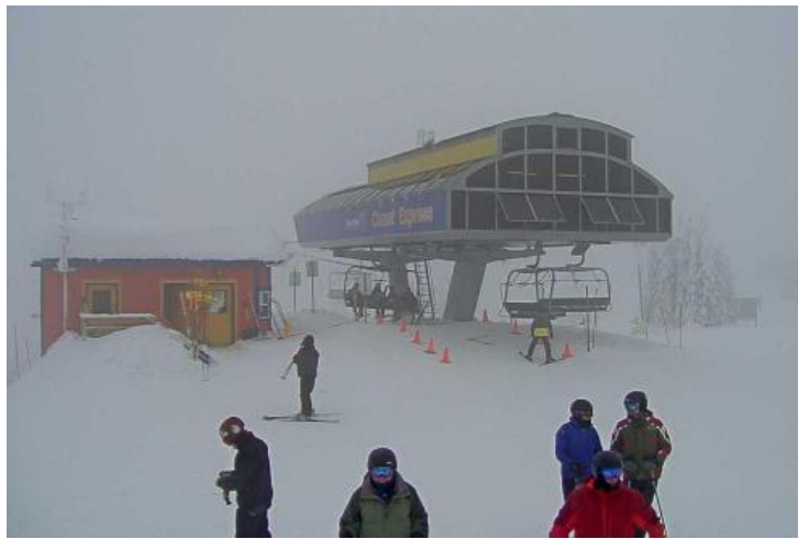
Wintry looking conditions in Canada's Silver Star - 13 February 2020 - Photo: snoweye.com

Our next full snow report will be on Thursday 20 February 2020, but see Today in the Alps for regular updates