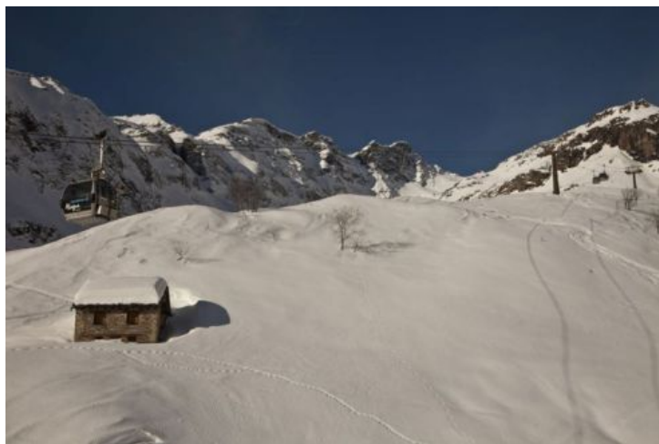
Plenty of good skiing on offer in the Monte Rosa region - 13 February 2020

Further east there is also plenty of good skiing available in the Dolomites, with base depths of 60/160cm in Madonna di Campiglio and 50/155cm in Selva .