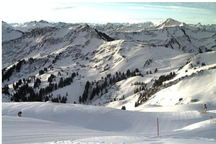
Good skiing in the Vorarlberg right now with more snow forecast tonight – 13 February 2020

The weather will be a bit mixed over the next few days – mostly dry and mild over the weekend, but with some showers or flurries early next week.