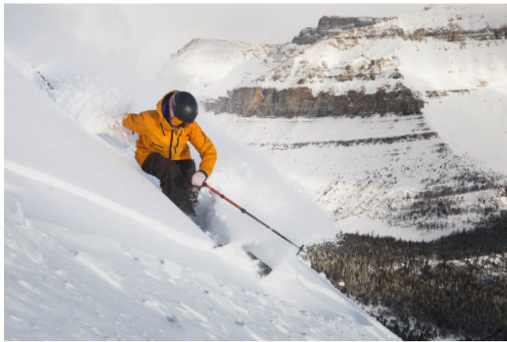
New snow in Lake Louise this week – 26 November 2019 – Photo: skilouise.com

Our next full snow report will be on Thursday 28 November 2019, but see Today in the Alps for regular updates