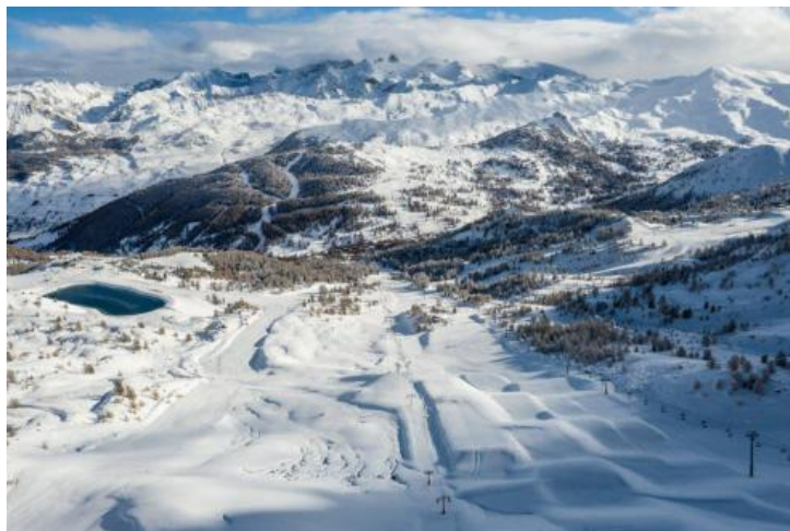
Looking great in Vars in the southern French Alps – 26 November 2019

Elsewhere in the northern French Alps, Val Thorens (65/85cm) is also open but with less snow, although there is still some reasonable piste-skiing on offer. Snow cover in the lower parts of the 3 Valleys (not yet open) is now a bit patchy though.