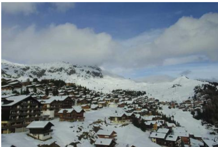
Plenty of snow in the Aletsch Arena in the southern Swiss Alps – 26 November 2019