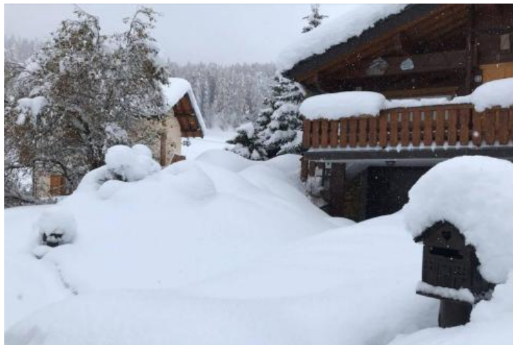
Lots of snow in the Italian Monte Rosa region – 26 November 2019

Cervinia (65/280cm) remains the best option in terms of extent (with most of the area now open) but a number of other resorts are also partially open. These include as Madonna di Campiglio (60/175cm) and Cortina (30/130cm), with more set to join the action this weekend (e.g. Bardonechia , Alta Badia ).