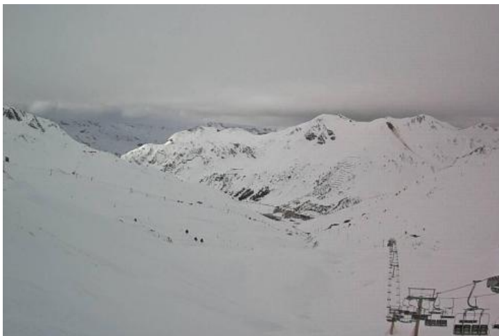
Good snow cover across most of the Pyrenees. This is Spain's Astun – 26 November 2019

Lots of Scandinavian resorts are also partially open, including Finland's Levi (45cm upper base) and Norway's Hemsedal (85cm upper base).