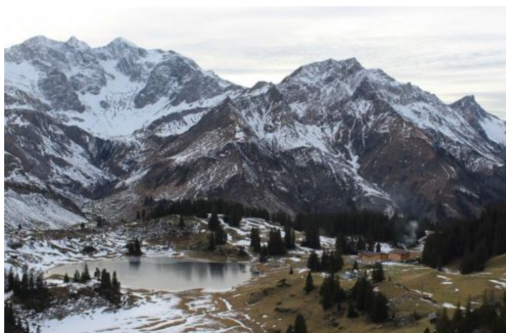
The Foehn has melted much of the snow across the northern Alps. This is Warth-Schröcken in the Austrian Vorarlberg – 26 November 2019

Further north in Austria the Foehn has taken its toll, especially lower down. Lech , for example, still plans to open this Friday but has lost most of its natural snow, although some is now forecast later in the week.