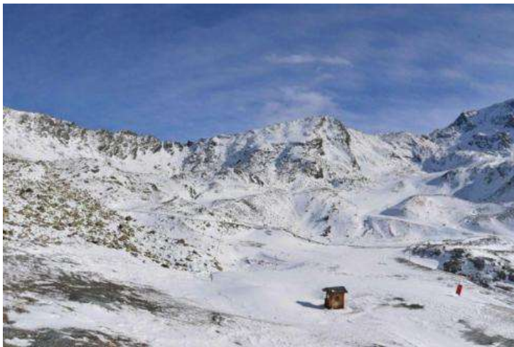
Natural snow cover is still on the thin side in Val Thorens – 11 November 2021 – Photo: val thorens.com