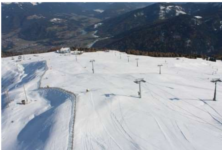
Good natural snow cover supplemented by snow cannons in Kronplatz – 11 November 2021 – Photo: kronplatz.com