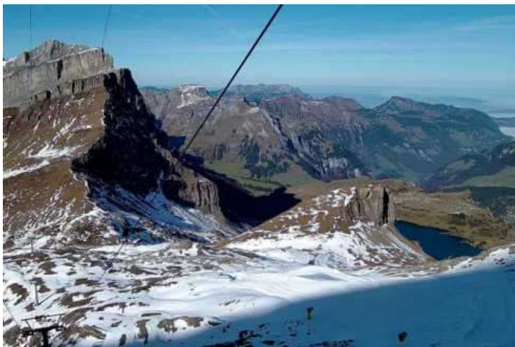
The Foehn has accelerated the thaw on the northern side of the Alps, as here in Engelberg (pictured) – 11 November 2021 – Photo: titlis.ch