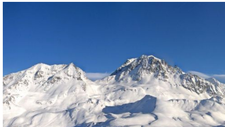
Lots of sunshine expected in the Alps over the next few days. This is the Aiguille Rouge (left) and Mont Pourri (right), viewed from Les Arcs – 12 February 2019 – Photo: lesarcs.com

It will feel mild at altitude, with freezing levels gradually creeping up towards 3000m by the end of the week.