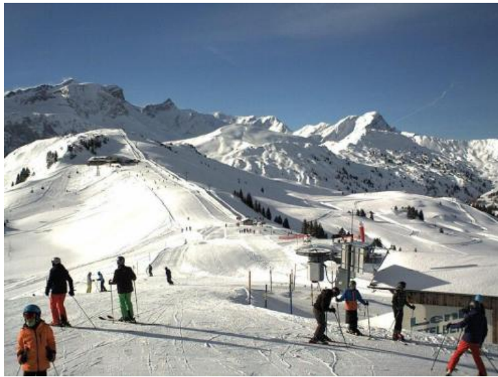
Great weather and snow conditions in Lenk - 12 February 2019