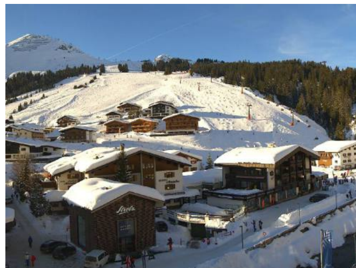
Late afternoon sunshine in Lech today – 6 February 2019 – Photo: lech.com