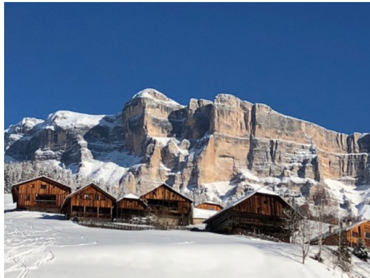
Fabulous weather this week in the Alta Badia - 6 February 2019

Friday and Saturday will be mostly dry with plenty of sunny spells, and freezing levels generally between 1200m and 2000m.