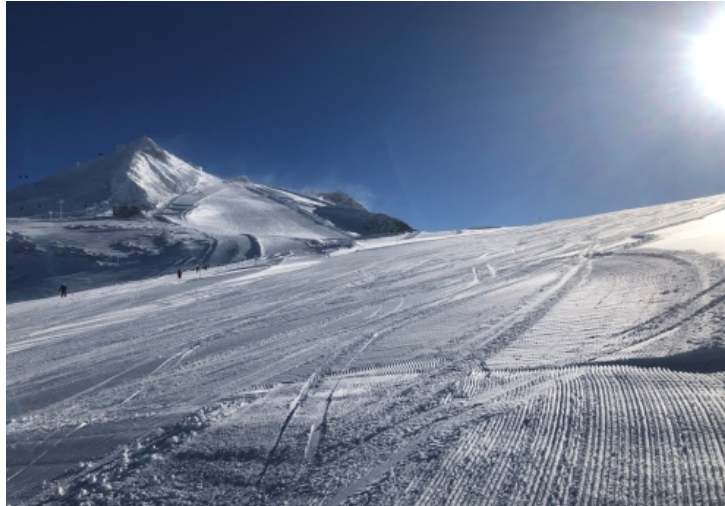
Short lived weather window on the Hintertux glacier today – 11 January 2019 – Photo: James Reidy

On Sunday night and into Monday the precipitation will intensify, and it will turn colder again, meaning the return of heavy snow to the lower valleys.