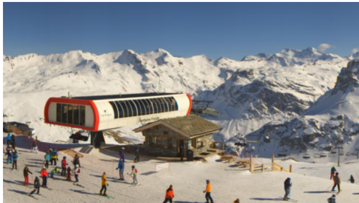
Val d'Isère is offering excellent snow conditions right now – 28 March 2019 – Photo: valdisere.com