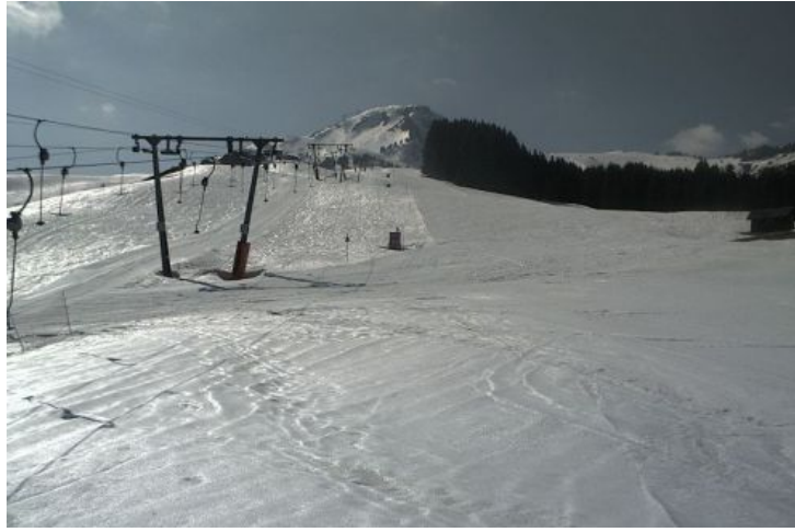
Spring snow conditions in Champoussin in the Portes du Soleil – 28 March 2019