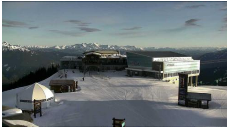
View from the upper mountain in Whistler – 28 March 2019 – Photo: whistlerblackcomb.com

Our next full snow report will be on Thursday 4 April 2019, but see Today in the Alps for regular updates