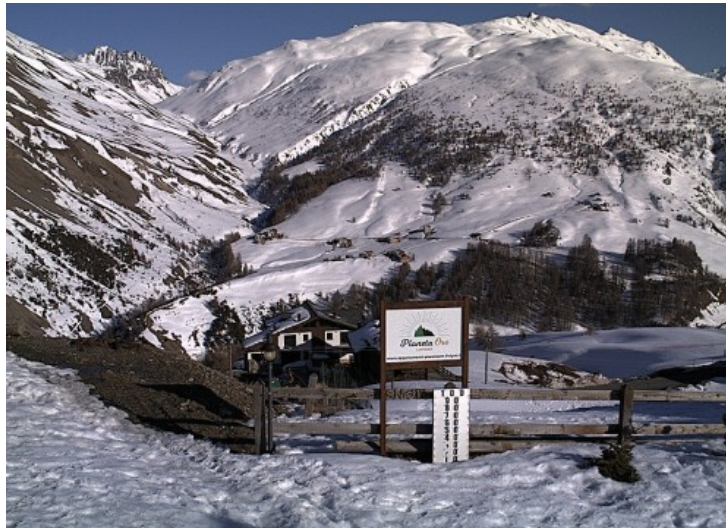
Livigno is one of the better bets in Italy for a late season ski holiday – 28 March 2019

Spring conditions will be the order of the day across most Italian resorts over the next few days before it turns colder next week. Significant new snow seems unlikely at this stage, however.