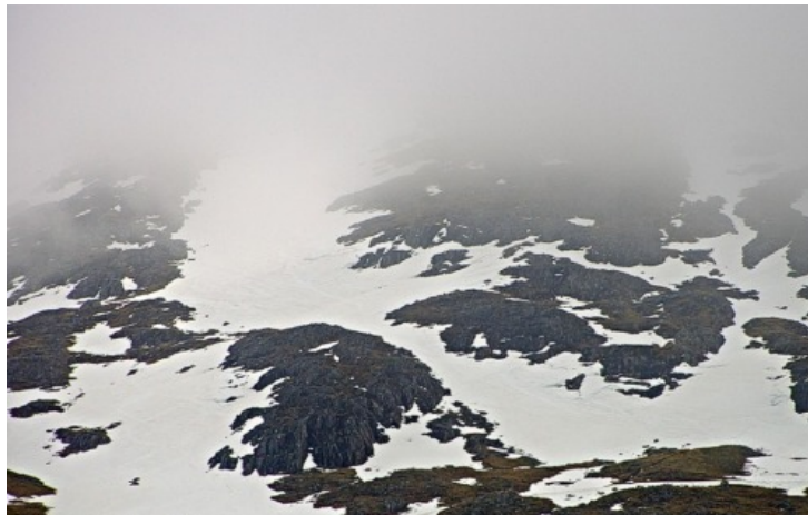
Less than ideal snow conditions in Scotland right now. This is Glencoe – 28 March 2019 – Photo: winterhighland.com

Skiing in Scotland remains very limited with the best of the action at Glencoe .