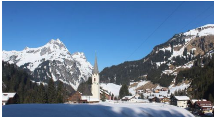
Beautiful weather and good snow in Warth-Schröcken – 28 March 2019 – Photo: warth-schroecken.at

Over the next few days warmer weather will mean increasingly spring-like snow, but colder weather will return next week with the chance of new snow.