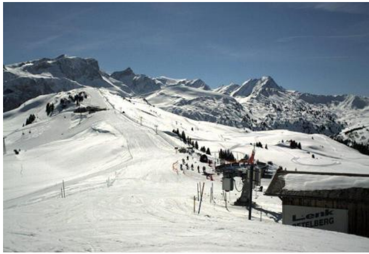
Good snow cover in the Lenk-Adelboden area even if spring-conditions are the order of the day – 21 March 2019 – Photo: lenk.ch