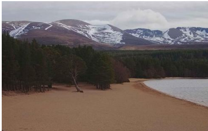
Very patchy snow cover in the Cairngorms following a spell of mild and very windy weather – 21 March 2019

It's better news in Scandinavia where there is still plenty of good skiing on offer. Norway's Hemsedal , for example, is fully open with base depths of 90/130cm, while Sweden's Åre has 75/90cm.