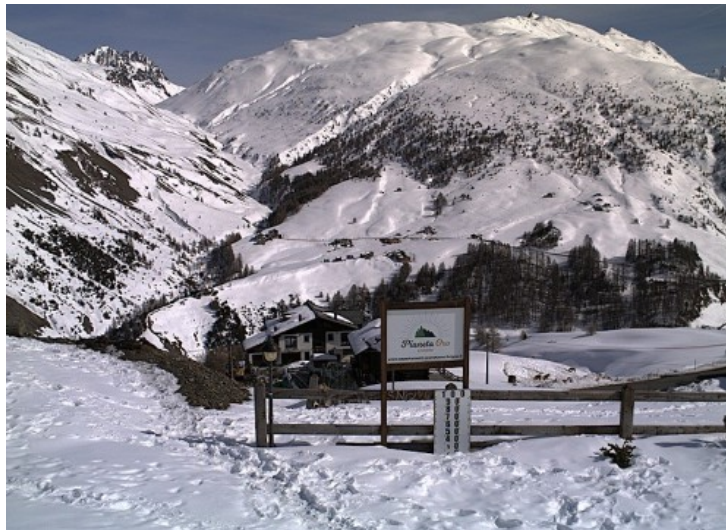
Excellent snow conditions for late March in Livigno – 21 March 2019

No new snow is expected in Italian resorts any time soon but, after a peak in temperatures on Saturday, it will turn colder again later in the weekend and especially early next week.