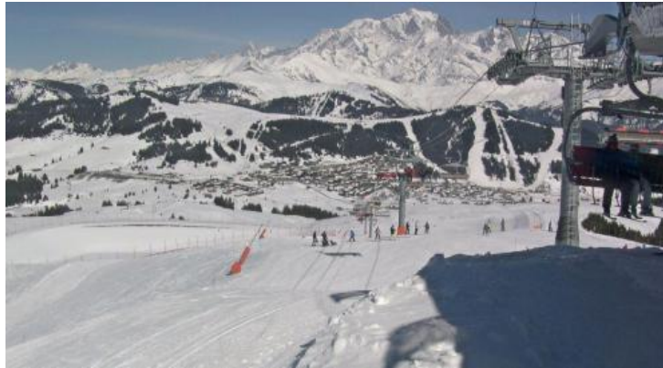
Excellent snow cover still in Les Saisies, despite its modest altitude – 21 March 2019

That said, it will turn colder again early next week, meaning that the daily "softening" process will become slower, at least for a time.