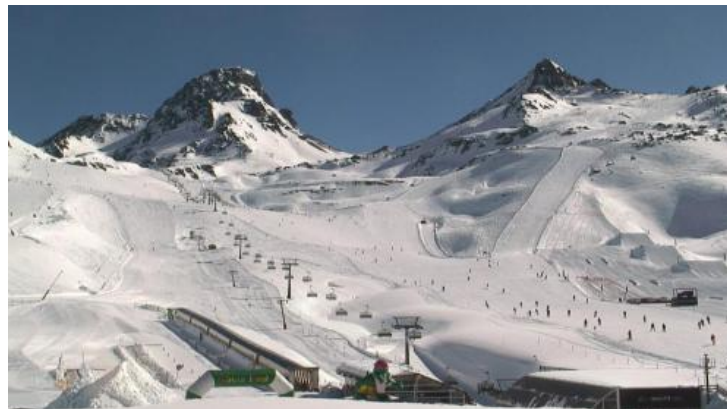
Great skiing on the high altitude pistes of Ischgl – 21 March 2019 – Photo: ischgl.com

It will turn colder again next week with new snow in places.