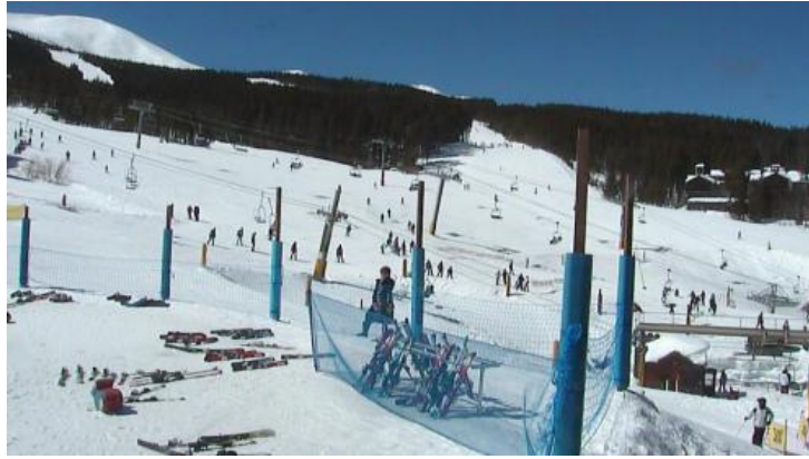
Good piste skiing in high altitude Breckenridge – 21 March 2019