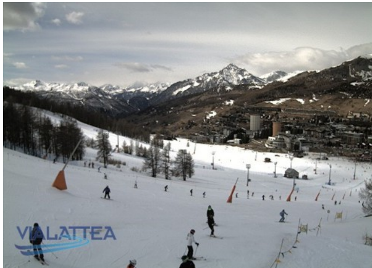
Spring snow conditions in the southern Piedmonte. This is Sestriere – 14 March 2019

Most Italian resorts (aside from those in the high border areas) are not expecting any significant snow any time soon.