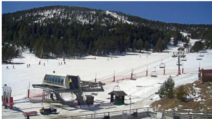
Spring-like conditions this weekend in the Pyrenean resort of Formigüeres – 14 March 2019

There is still some excellent skiing on offer in Scandinavia too. Norway's Hemsedal is 100% open, with 110cm up top and more snow forecast later this weekend. Further north, Sweden's Åre is also in good shape with an upper base of 87cm.