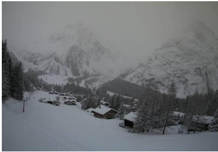
Snowing heavily this afternoon at La Fouly near Verbier – 14 March 2019