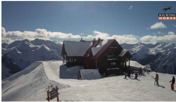
Still some great skiing on offer in Kicking Horse - 14 March 2019 - Photo: kickinghorsesort.com

Our next full snow report will be on Thursday 21 March 2019, but see Today in the Alps for regular updates