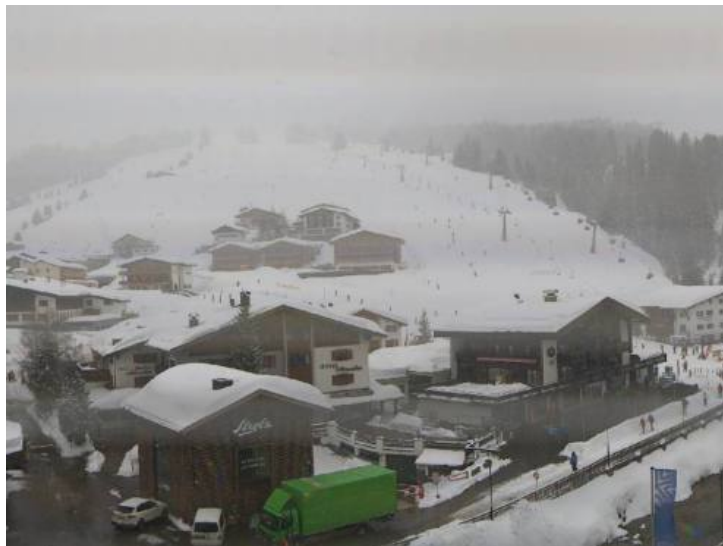
Snowing again today in Lech – 14 March 2019 – Photo: lech.com

Lower down, resorts such as Saalbach (90/200cm) still have decent cover, but have more variable snow quality.