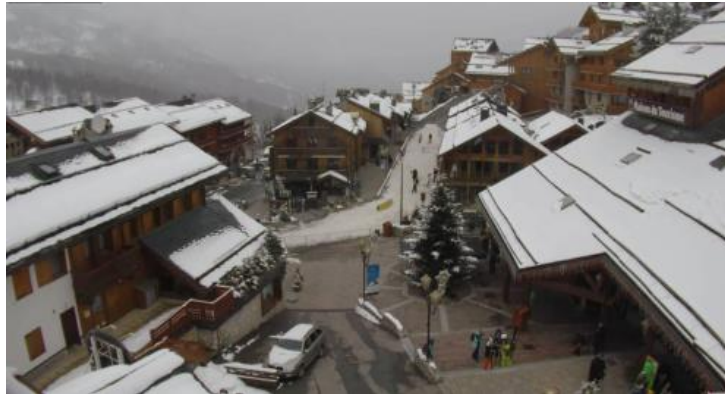
Light snow today in Méribel – 14 March 2019

By contrast, the southern French Alps have seen little or no new snow in recent days. There is still some good piste skiing available in resorts like Risoul (50/90cm) but the atmosphere here is much more spring-like.