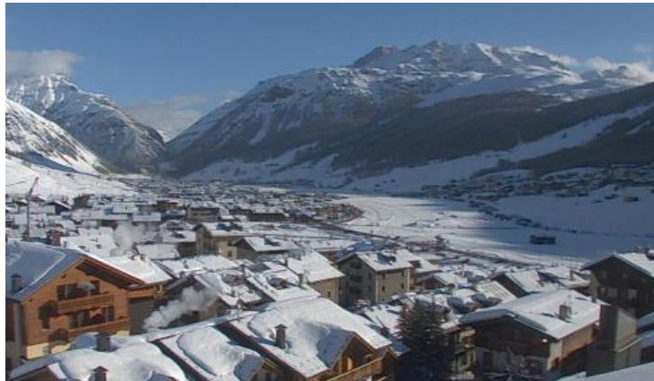
Excellent snow conditions in high altitude Livigno – 8 March 2019

Bits and pieces of new snow are forecast over the next few days though, with the exception of some high border areas (e.g. Cervinia), it is unlikely to be significant.