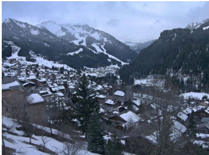
Good snow cover even to lower altitudes still in the Portes du Soleil. This is Châtel – 8 March 2019 – Photo: chatel.com