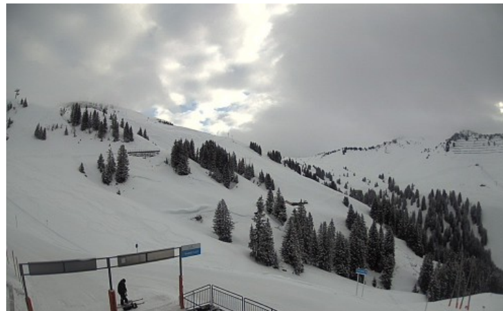
Early morning clouds in the Austrian Vorarlberg. This is Diedamskopf – 8 March 2019

Some new snow is expected over the next few days, heaviest in the west (e.g. St Anton) on Sunday and Monday. There may also be some rain lower down, however, especially on Sunday.