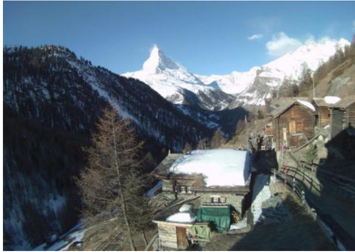
Looking a little spring-like low down in Zermatt, but there is still lots of good skiing at altitude – 8 March 2019