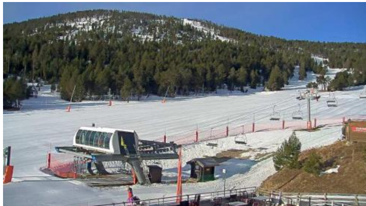
Immaculate grooming in Formiguères in the French Pyrenees – 8 March 2019

The situation in Scotland remains poor. Some new snow has been accumulating at altitude in recent days, especially in the west, but any lift-served skiing is currently limited to some beginner areas at Glencoe and the Lecht .