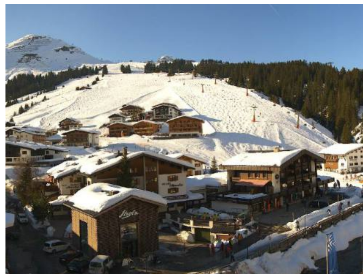
Another lovely day in Lech today, but the weather is on the turn – 28 February 2019