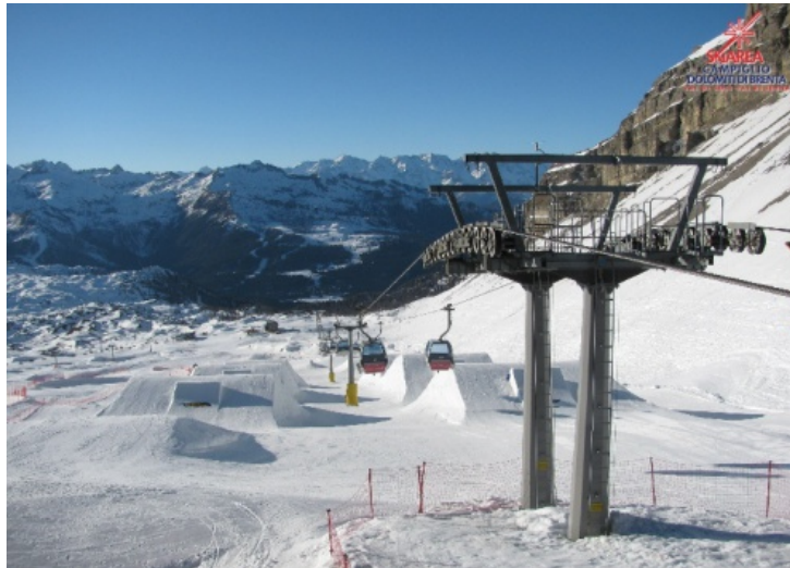
Good piste skiing in Madonna di Campiglio – 28 February 2019 – Photo: funiviecampiglio.it

The forecast is for the weather to turn more unsettled over the next few days, but large amounts of snow are not expected.