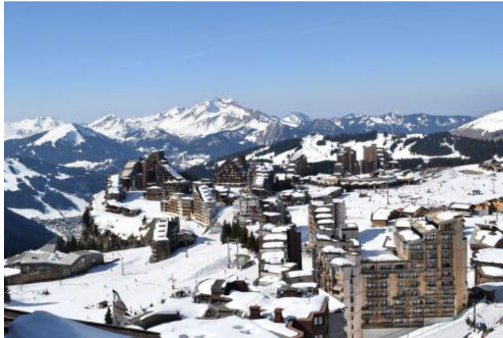
Excellent snow cover still in Avoriaz, despite the recent spring-like weather – 28 February 2019

For the most consistent snow quality you will need to stay high. Val d'Isère currently has base depths of 104/214cm depending on altitude, while Serre Chevalier has 48/232cm.