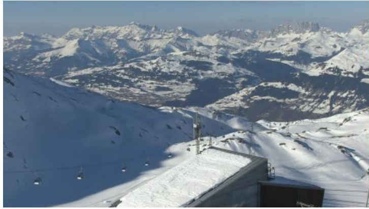
Plenty of snow still in Davos – 28 February 2019