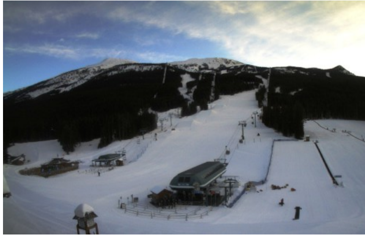
Lake Louise early this morning – 28 February 2019 – Photo: skilouise.com

Our next full snow report will be on Thursday 7 March 2019, but see Today in the Alps for regular updates