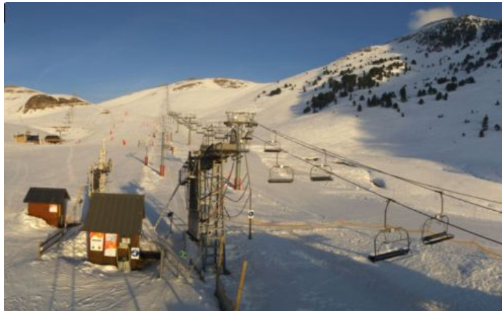
Good snow cover still in the French Pyrenees, at least at altitude. This is Saint Lary – 28 February 2019 – Photo: saintlary.com

The weather remains relatively mild across Scandinavia. That said, there is still plenty of good piste skiing on offer, with upper base depths of 80cm in Norway's Hemsedal and 70cm in Sweden's Åre .