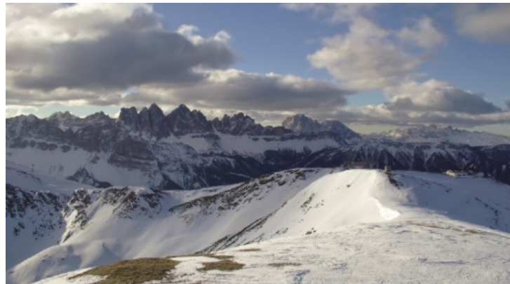
Partly cloudy but still some decent sunny spells in the Dolomites today. This is Brixen – 22 February 2019

Lower down, resorts such as Selva (80/140cm) and Courmayeur (40/150cm) can still offer some very enjoyable piste skiing - just look out for a little afternoon slush on slopes exposed to the sun.