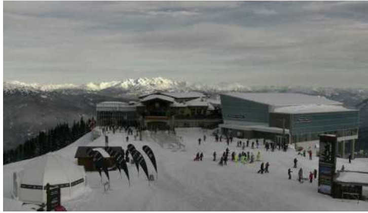
View from the Roundhouse lift station in Whistler yesterday – 21 February 2019 – Photo: whisterblackcomb.com

Our next full snow report will be on Thursday 28 February 2019, but see Today in the Alps for regular updates