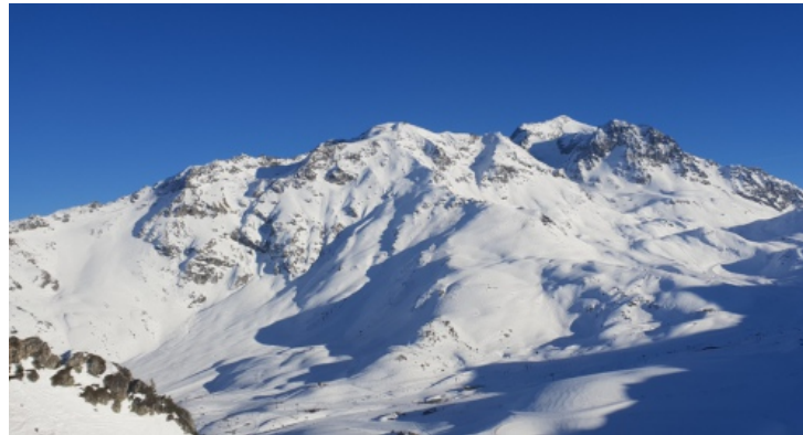
Excellent piste skiing in Les Arcs this week, especially here above Arc 2000 – 21 February 2019

Right now, base depths in Les Arcs are 135/260cm, while Megève has 80/210cm.