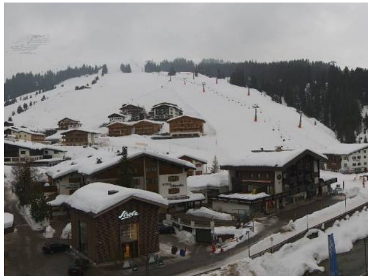
Cloudier in Lech today - 22 February 2019 - Photo: lech.com

Right now Lech has settled snow depths of 70/340cm, while Obertauern has 250/310cm.