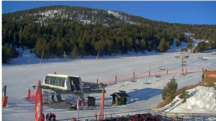
Lots of sunshine in the Pyrenees right now. This Formiguères – 22 February 2019

Mild weather has also been affecting Scandinavia, although there is still plenty of decent skiing on offer. Norway's Hemsedal has upper base depths of 95cm while Sweden's Åre has 77cm.