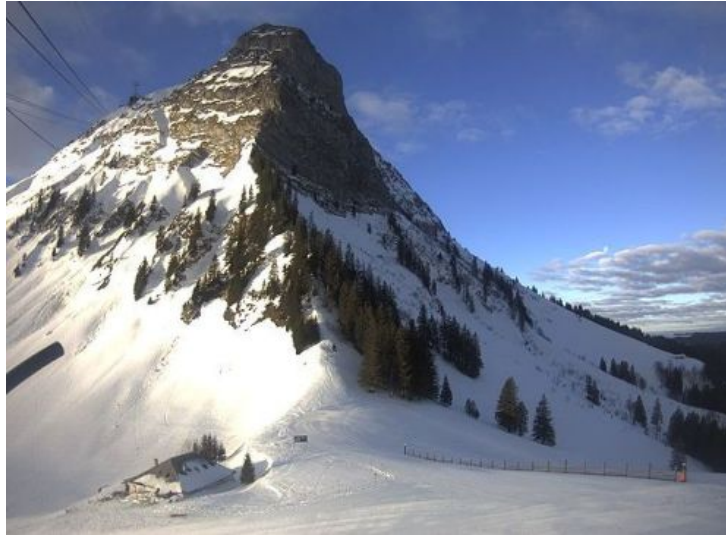
Sunny again in western Switzerland today. This is Moleson – 22 February 2019