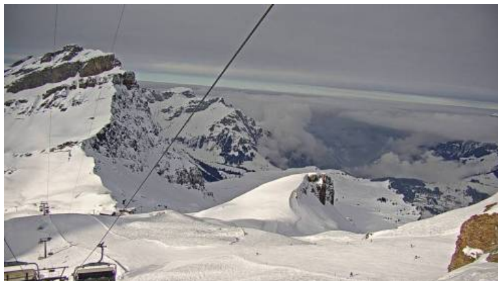
Excellent snow conditions in Engelberg, with more snow forecast on Sunday – 25 January 2019 – Photo: engelberg.ch

There is also further snow in the forecast for Sunday and Monday across the Swiss Alps.