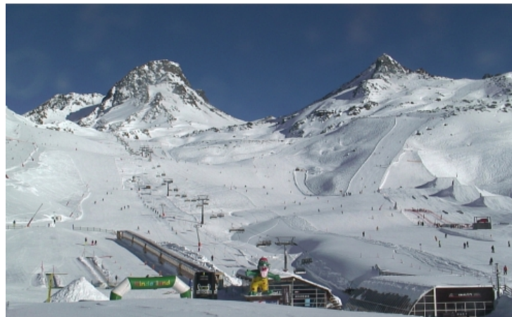
Near perfect snow conditions in Ischgl – 25 January 2019

There is some snow in the forecast over the next few days, especially to the east of Salzburg on Saturday and then in the west (e.g. St Anton/Lech) later on Sunday and Monday.