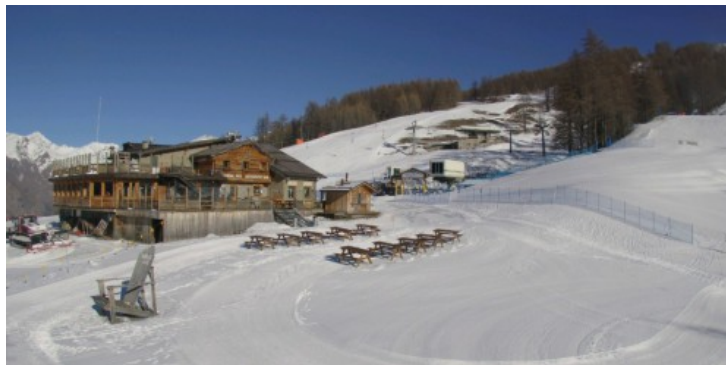
Good piste skiing in Bardonecchia – 25 January 2019

Some snow is forecast for Sunday and Monday but any significant falls will be localised, with the far north-west (e.g. La Thuile, Courmayeur) most likely to be favoured.