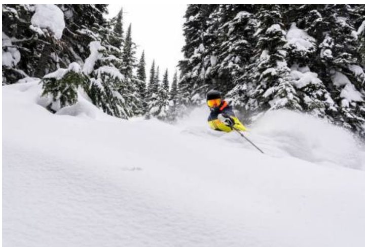
Powder skiing in Whistler this week – 25 January 2019 – Photo: facebook.com/WhistlerBlackcomb

Further east, Lake Louise (141cm upper base) is also skiing well with snow forecast here on Sunday.