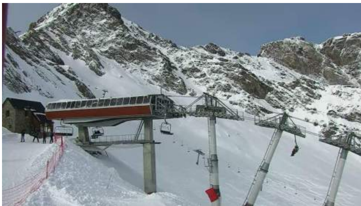
Much improved snow conditions in the Pyrenees. This is Cauterets – 25 January 2019 – Photo: cauterets.com

The situation in Scotland is finally improving with four of its five ski areas now able offer limited skiing. The best resort for now is probably Glencoe (no official published depths) but more snow is forecast for all Scottish ski areas over the next few days.