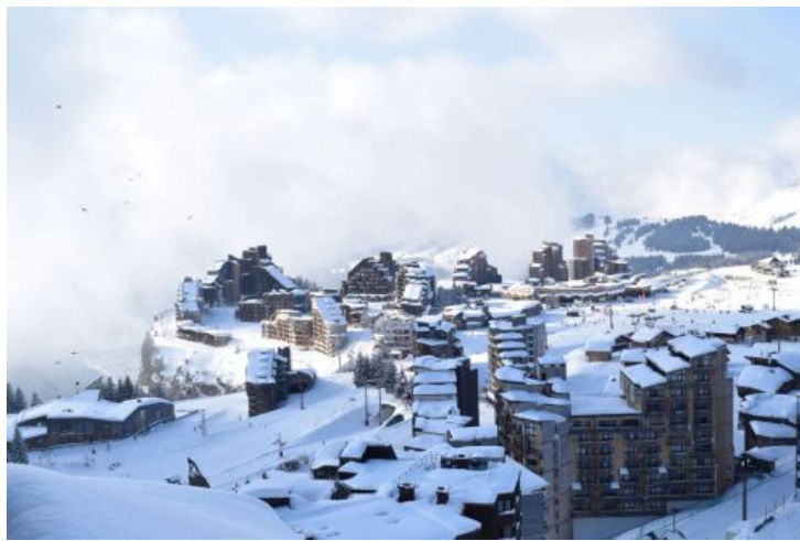
Great skiing on offer in Avoriaz, with further snow forecast later this weekend – 25 January 2019 – Photo: avoriaz.com