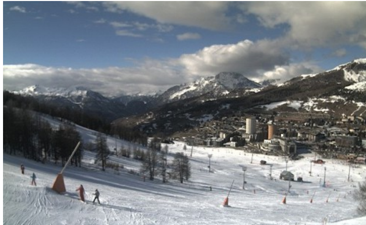
Modest depths but decent piste skiing in the Italian Milky Way. This is Sestriere – 17 January 2019 – Photo: vialattea.it

Snow depths are much more modest lower down, especially in the Dolomites, but they are expecting a moderate fall here overnight, especially in the eastern Dolomite resorts such as Cortina (5/30cm).