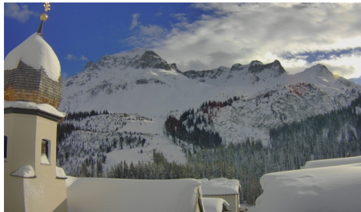
Clouding over in Lech this evening with snow expected overnight - 17 January 2019

Further light or moderate snow is due across most Austrian ski resorts tonight.