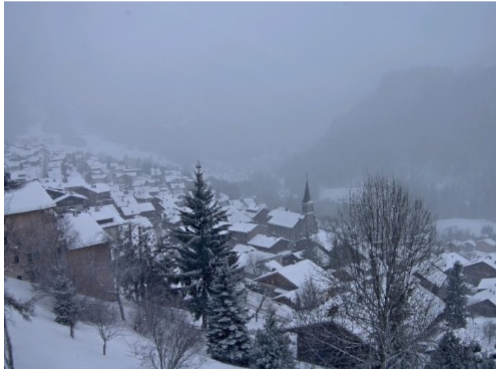
Light snow falling this afternoon in Châtel – 17 January 2019

Some new snow is falling across the French Alps again this evening, most of it in the north (e.g. Portes du Soleil).