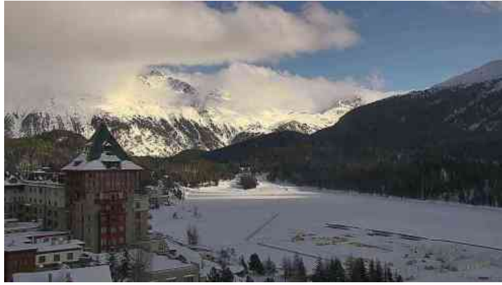
Good snow conditions in St Moritz right now, with a small top-up expected tonight – 17 January 2019