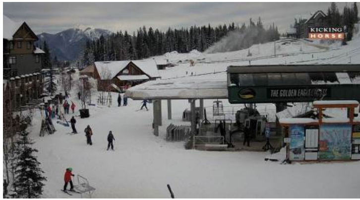
Excellent snow conditions across most western Canadian resorts. This is Kicking Horse – 28 December 2018 – Photo: kickinghorsesort.com

Next full snow report will be on Monday 31 December 2018, but see Today in the Alps for regular updates