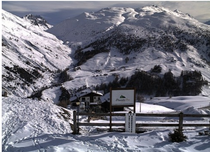
Livigno is in pretty good condition right now – 28 December 2018 – Photo: livigno.eu

For the very best snow conditions, however, the higher resorts of Cervinia (80/190cm) and the Monte Rosa region (5/170cm) are still as good as anywhere right now.