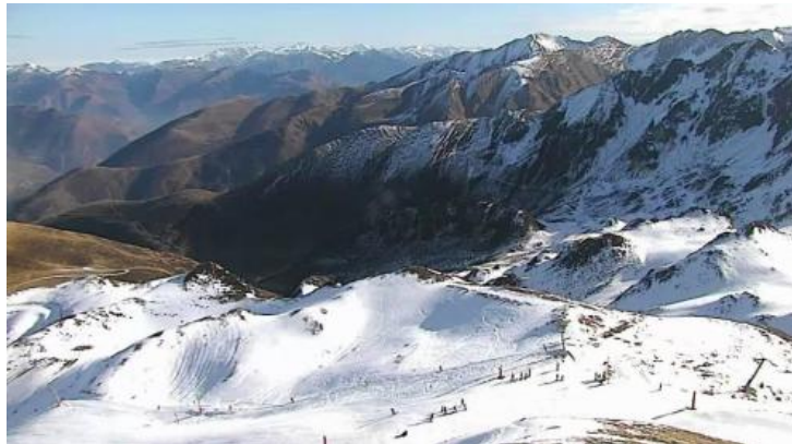
Very modest snow cover across much of the Pyrenees. This is Peyragudes – 28 December 2018 – Photo: peyragudes.com

There is still insufficient snow cover for proper lift-served skiing in any of the Scottish ski resorts.