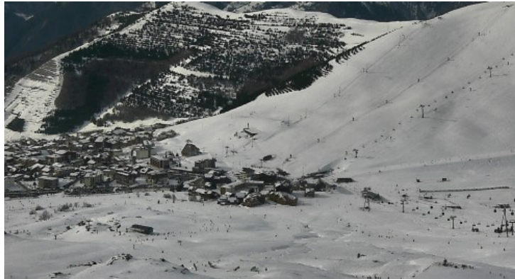
Decent snow cover in high altitude Alpe d'Huez – 28 December 2018

For better snow quality you need to be skiing in areas with plenty of terrain above 2200m, such as Tignes (90/185cm) or Val Thorens (95/150cm), or in the far south where resorts such as Isola 2000 (70/80cm) avoided the recent rain.