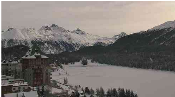
Cloudy but dry for now in St Moritz – 21 December 2018 – Photo: engadin.stmoritz.ch

The best snow conditions next week are therefore likely to be in the higher ski resorts of the southern Swiss Alps, such as Zermatt (15/220cm), Saas-Fee (15/300cm) and St Moritz (40/120cm).