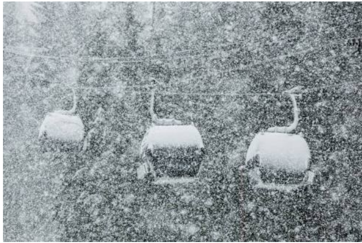
Masses of snow in Whistler this week – 21 December 2018 – Photo: facebook.com/WhistlerBlackcomb

Further east, snow conditions in the Banff/Lake Louise area (89/120cm) are also very good right now, with around 40cm of new snow in the last week, 10cm of which has fallen in the last 24 hours.