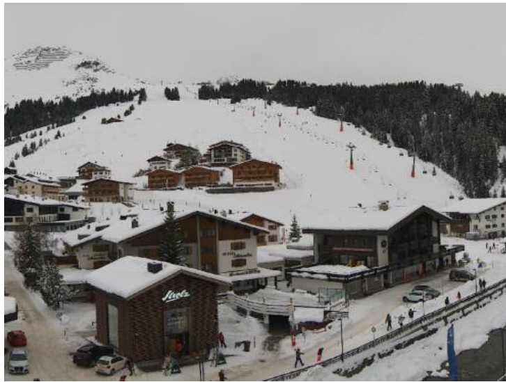
Cloudy in Lech this morning, with snow then eventually rain expected later – 21 December 2018