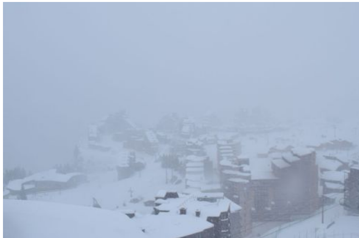
It's snowing in Avoriaz this morning, but it will probably turn to rain later – 21 December 2018

For the best snow conditions next week you therefore either need to aim high or much further south. For example, in Val Thorens (120/150cm) any precipitation should fall as snow, while the southerly resort of Isola 2000 (70/80cm) will completely avoid any rain or snow over the coming days.