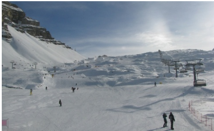
Brighter conditions on the southern side of the Alps. This is Madonna di Campiglio – 21 December 2018 – Photo: funiviecampiglio.it