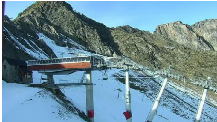
Threadbare slopes before today's snowfall in Cauterets in the French Pyrenees – 13 December 2018 – Photo: cauterets.com

Meanwhile, snow cover remains patchy in Scotland where any skiing this weekend will be very limited – if it happens at all.