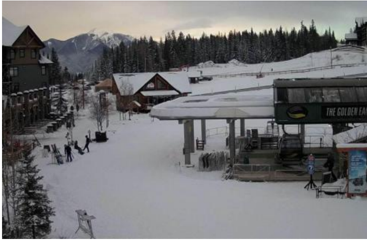
Good early season snow cover in Kicking Horse, Canada – 13 December 2018 – Photo: kickinghorsesort.com

Next full snow report will be on Monday 17 December 2018, but see Today in the Alps for regular updates