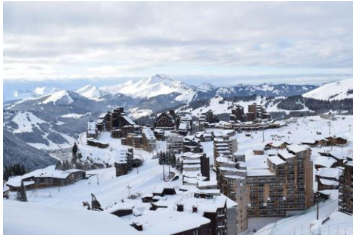
Looking good in Avoriaz ahead of its opening day tomorrow – Photo: avoriaz.com, 13 December 2018

The southern French Alps are also offering some excellent skiing right now, even if they did miss the brunt of the most recent storms. Montgenèvre , for example, now has 60-120cm depending on altitude.