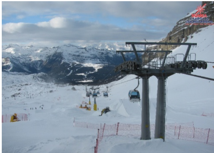
Good early snow conditions in Madonna di Campiglio – 13 December 2018 – Photo: funiviecampiglio.it

The Dolomites generally have slightly less snow but can still offer fantastic piste skiing, thanks to their world-class snow-making. Base depths in Kronplatz are 15/35cm, for example.