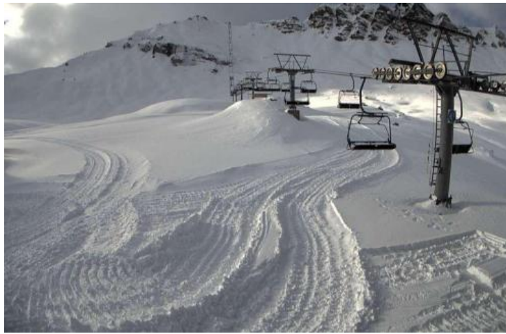
Much improved snow cover on the Swiss side of the Portes du Soleil. This is Champéry – 13 December 2018