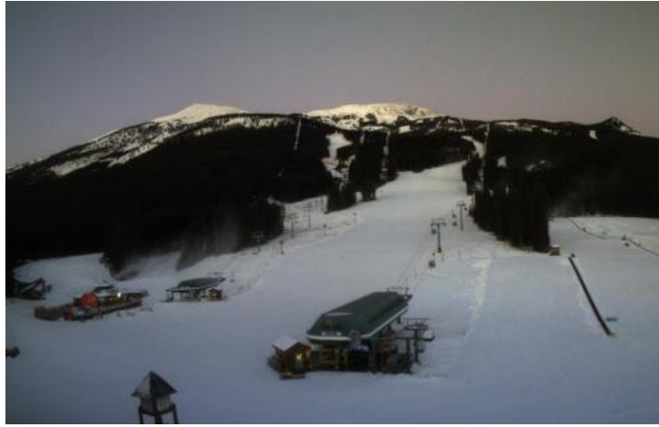
Decent snow cover in Lake Louise – 6 December 2018 – Photo: skilouise.com

Our next full snow report will be on Thursday 14 December 2018, but see Today in the Alps for regular updates