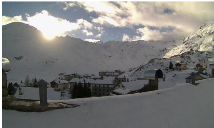
Excellent cover in the higher ski resorts of the central Italian Alps. This is Madesimo – 6 December 2018 – Photo: madesimo.com

Among the bigger names set to open this weekend are Sauze d'Oulx and Sestriere , where snow cover is also pretty decent for the time of year, at least at altitude.