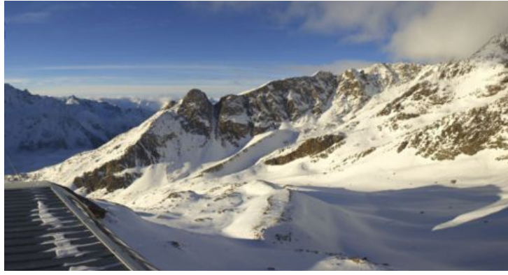
Excellent snow cover in the Saas valley in southern Switzerland – 6 December 2018 – Photo: saas-fee.ch