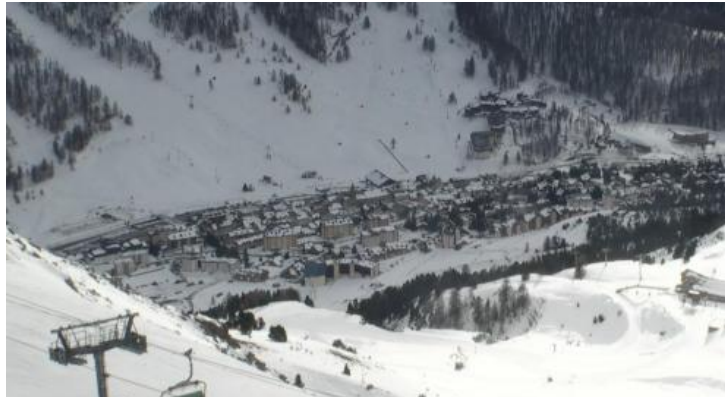
Great snow conditions in the southern French ski resort of Montgenèvre – 6 December 2018

In the southern French Alps, snow conditions are more consistent, with 40/60cm in Isola 2000 depending on altitude, and a highly impressive 60/100cm in Montgenèvre .