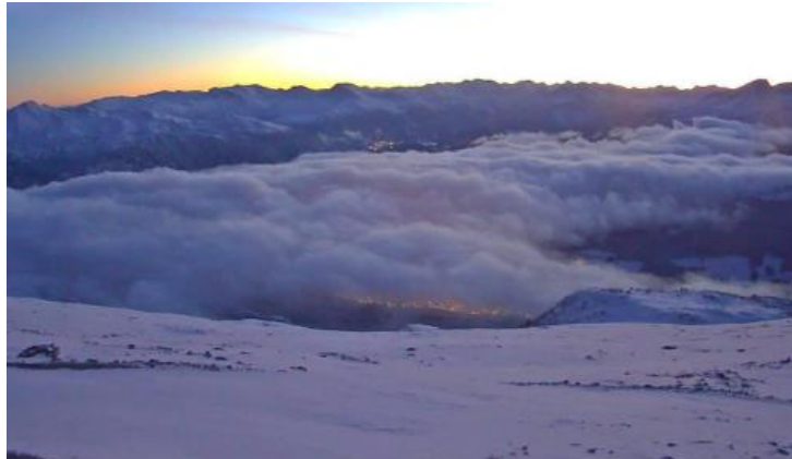
Thin snow cover but still looking wintry across Norway. This is Stranda ski resort – 6 December 2018

A handful of ski resorts are now up and running in Scandinavia albeit on a modest base and generally with plenty of artificial help. Norway's Lillehammer has base depths of 0/50cm while Finland's Ruka has 5/20cm.