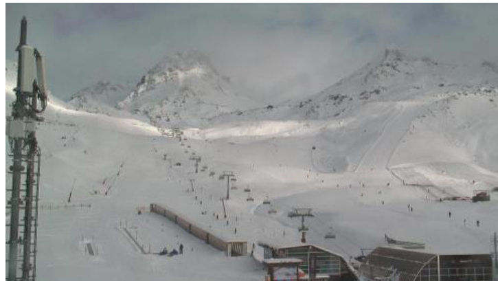
Good snow conditions at altitude in Ischgl, but more is needed lower down still - 6 December 2018

The weather will turn much more wintry by early next week - great news for the large number of low Austrian skin resorts that are still looking a bit green.