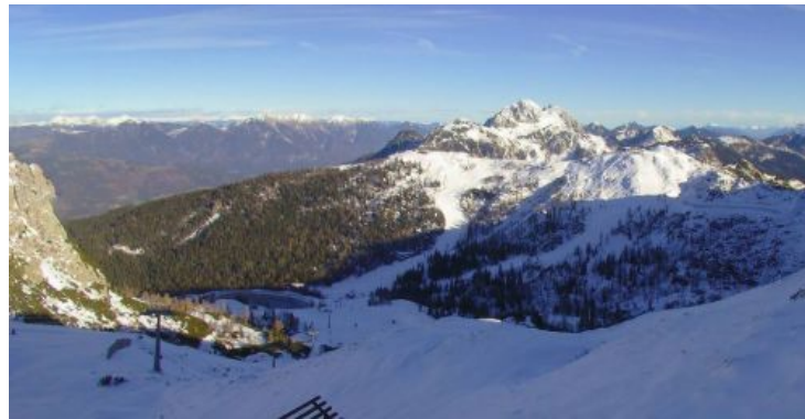
The best weather in Austria is in the far south right now. This is Nassfeld – 3 December 2018 – Photo: nassfeld.at

Snow should return to the Austrian Alps this weekend, even at lower levels.