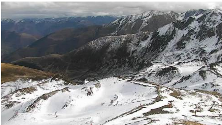
Milder air is affecting the snow in the Pyrenees. This is Peyragudes – 3 December 2018 – Photo: peyragudes.com

In Scotland, it was possible to ski on a limited basis in Glencoe and the Lecht (thanks to artificial snow) last weekend, but snow cover remains very patchy.