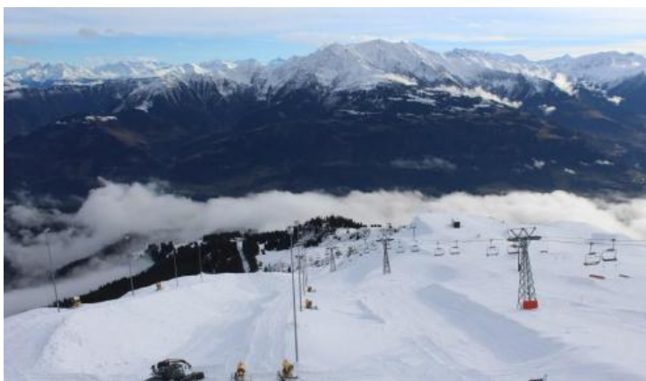
Reasonable snow cover at altitude in Laax, but more would be welcome – 3 December 2018 – Photo: laax.com