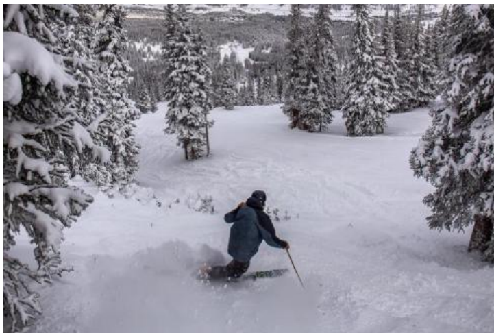
Lovely powdery snow in Copper Mountain last weekend – 2 December 2018

Most western US ski resorts are offering excellent snow conditions, with over 1m of settled snow up top in Colorado's Vail , where most trails are now open. In Wyoming, Jackson Hole (56/117cm) is another resort in great shape, with plenty of cold, powdery snow on offer.