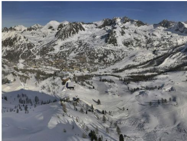
Great snow and great weather in the far southern French Alps. This is Isola 2000 – 3 December 2018