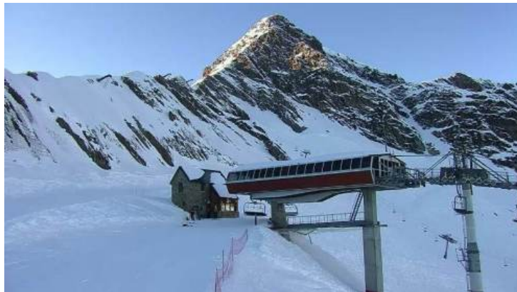
Good early snow cover in the French Pyrenees. This is Caunterets - 4 December 2017 - Photo: caunterets.com

Across in Scandinavia lots of ski resorts are now at least partially open, with Norway's Hemsedal (60cm upper base) among the better options.