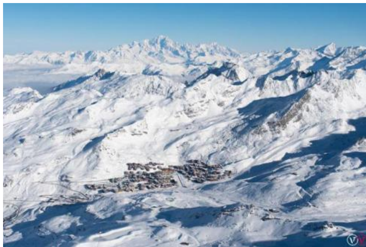
Looking good in the 3 Valleys. This is Val Thorens, which has already been open for some time – 4 December 2017 – Photo: facebook.com/Valthorens.resort

Many more resorts will open this weekend, including Courchevel and Méribel , and snow conditions should be excellent as more heavy snow is forecast on Friday.