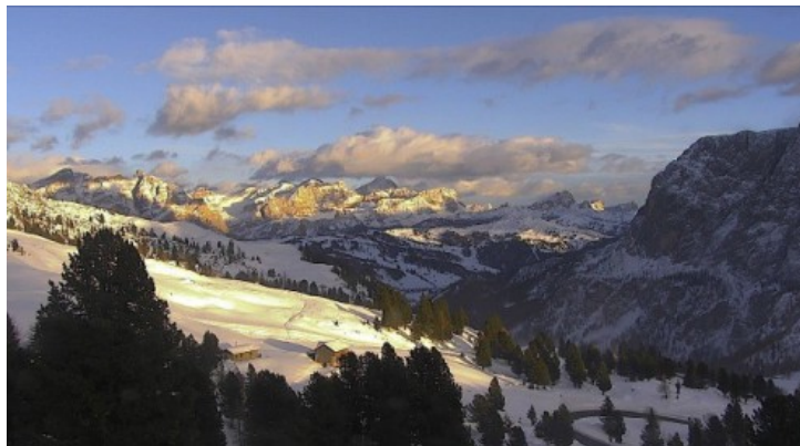
Beautiful low evening light across the Alta Badia region – 4 December 2017 – Photo: dolomitisuperski.com

Further snow is in the forecast towards the back end of next week but not as much as expected on the northern side of the Alps.