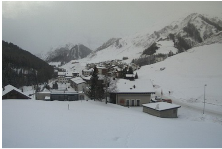
Lots of snow in the Samnaun-Ischgl area - 4 December 2017 - Photo: samnaun.ch