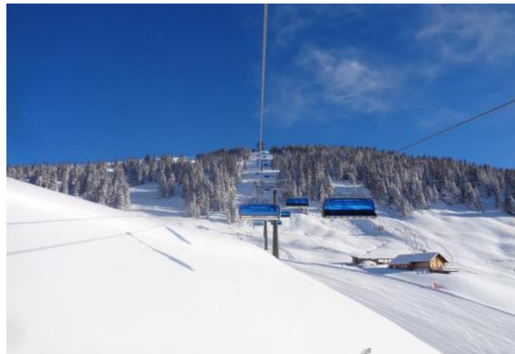
Fabulous snow conditions last weekend in the Saalbach-Hinterglemm area – Photo: facebook.com/SkiCircus

Further south, Nassfeld (25/110cm) may have only opened a dozen or so pistes but snow conditions are also excellent here for the time of year and more snow is forecast next weekend.