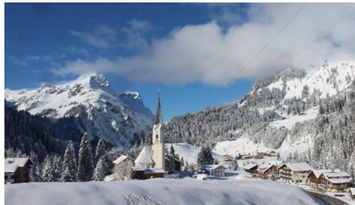
Picture postcard scenes in the Austrian Vorarlberg. This is Schröcken - 1 December 2017 - Photo: warth-schroecken.com