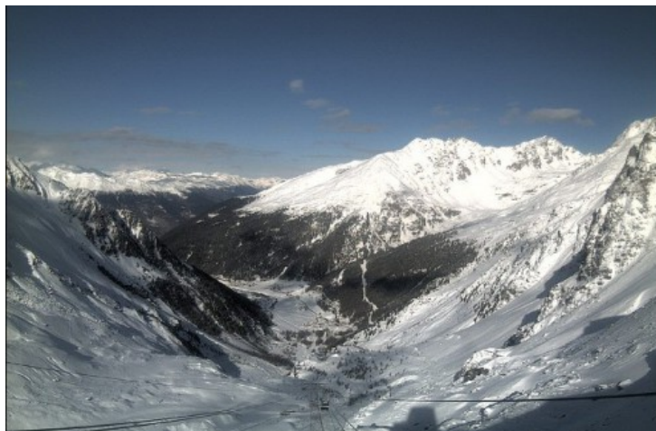
Good piste skiing in Suldens am Ortler right now - 1 December 2017

In between, the picture is much more mixed with currently very little snow in the Aosta valley, where skiing in Cervinia (5/130cm) is still limited. Some snow is forecast here today and tomorrow but it won't be nearly as heavy as further south (i.e. from Sestriere southwards).