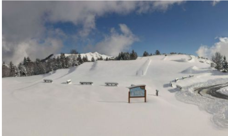
Lots of fresh snow in the French Pyrenees. This is the Val d'Azun – 1 December 2017

Most other non-European ski options are in Scandinavia. Norway's Geilo , for example, can offer 14 trails on an upper base some 90cm deep.