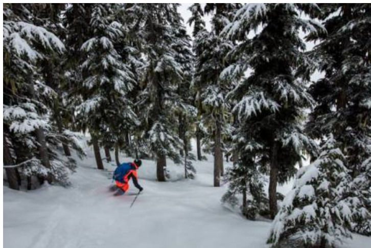
Excellent early snow conditions in Whistler – 1 December 2017 – Photo: facebook.com/whistlerblackcomb

There is also lots of great skiing to be had further inland, with the majority of trails now open in Lake Louise (89/139cm).