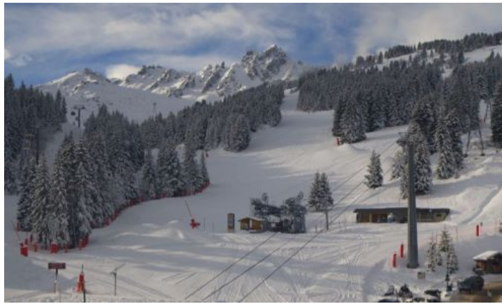
Looking good in Courchevel a week ahead of opening- 1 December 2017