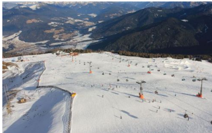
66km of pistes are already open in Kronplatz – 27 November 2017

The weather for the week ahead will at least be cold which should allow the snow cannons to operate. There may also be a little light snow, but probably nothing significant.