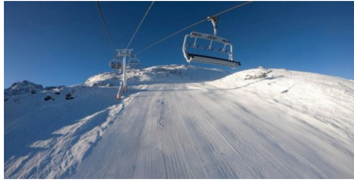
Plenty of early snow in Val Thorens – 27 November 2017

The forecast this week is a cold one with further snow at times, though mostly in the northern Alps.