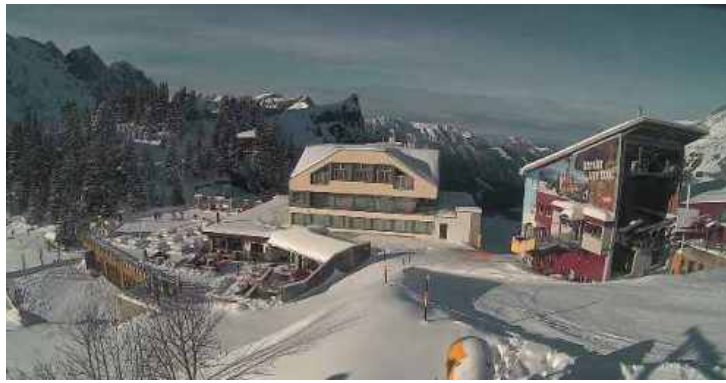
Fabulous early season snow in Engelberg – 27 November 2017