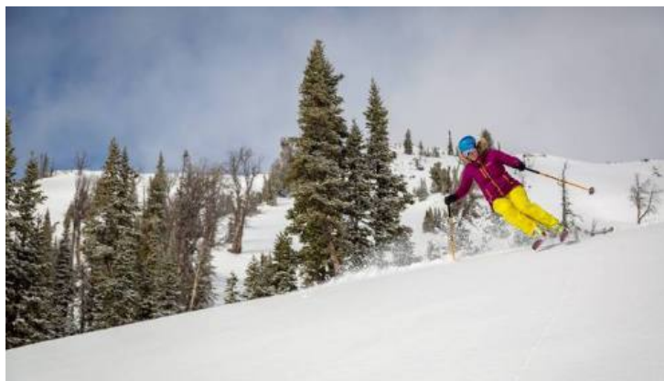
Good early skiing in Jackson Hole at the weekend – 25 November 2017

Further north the snow gets deeper, with 119cm up top in Jackson Hole where 33 runs are open, and 157cm at altitude in Mt Baker which has two runs available.