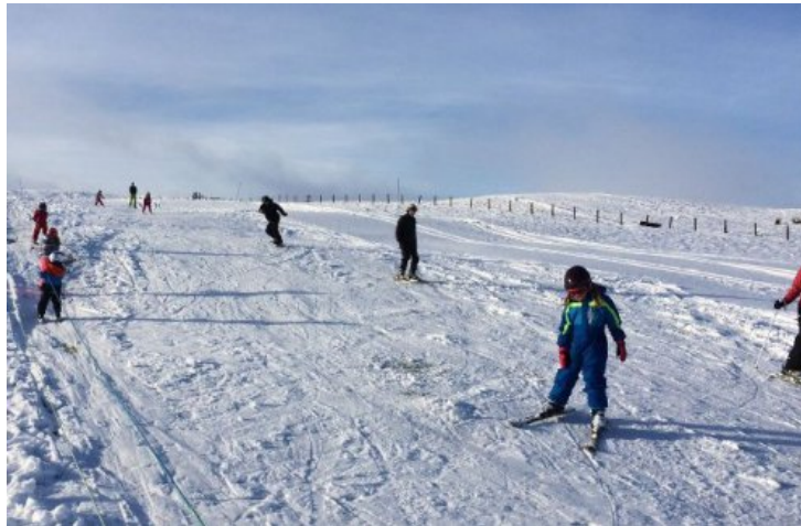
Lowther Hills is the first Scottish ski area to open! – 27 November 2017

Elsewhere in Europe, skiing is mostly confined to Scandinavia where dozens of resorts are now open, albeit on a limited basis. Finland's Levi , for example, has six runs open an upper base of 50cm.