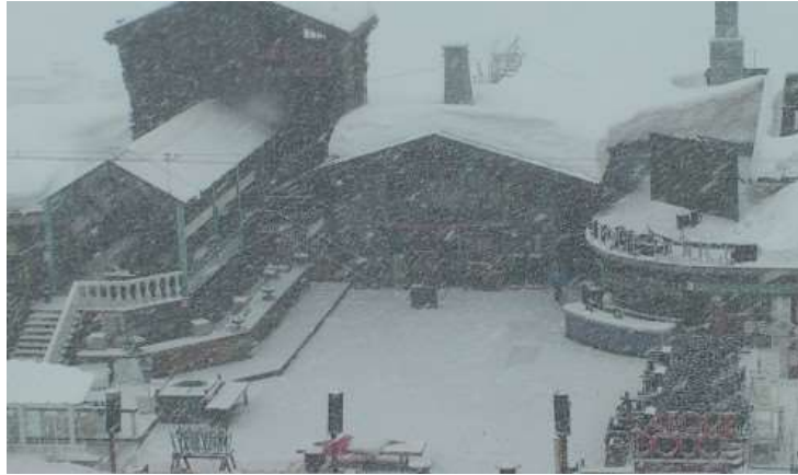
Heavy snow on Tuesday evening in Val d'Isère – 27 March 2018

around 1500m but will drop towards or below 1000m later.