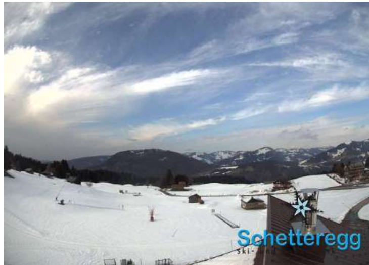
Bright skies across the Austrian Vorarlberg this evening. This is Schetteregg – 27 March 2018

Friday will see variable cloud and some sunny spells. Many places will be dry but showers will return to the south (Osttirol, Carinthia) with a rain/snow limit close to 1500m.