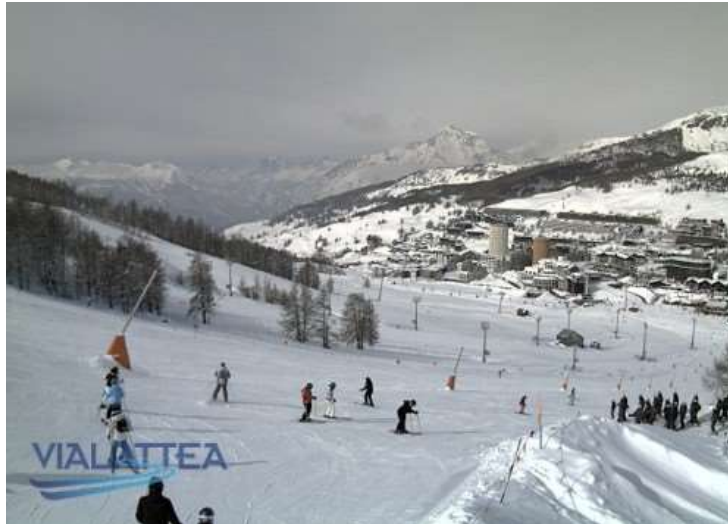
Clouds closing in over Sestriere this afternoon – 28 February 2018

It will remain changeable on Friday with the odd flurry here and there (800-1200m), but will feel milder.