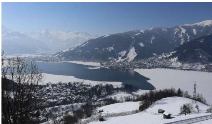
Sunny but still very cold in Austria today, This is Zell am See – 28 February 2018 – Photo: zellamsee-kaprun.com

Friday will be milder still with freezing levels reaching 2000m or more in the west. It will be rather cloudy but still mostly dry, with perhaps just the odd shower (snow 1200m) in the east.