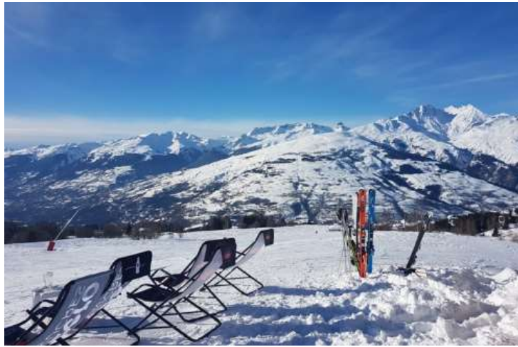
Sunny but very cold in Les Arcs today – 13 February 2018

showers (snow 2000m). Most places will stay dry though.