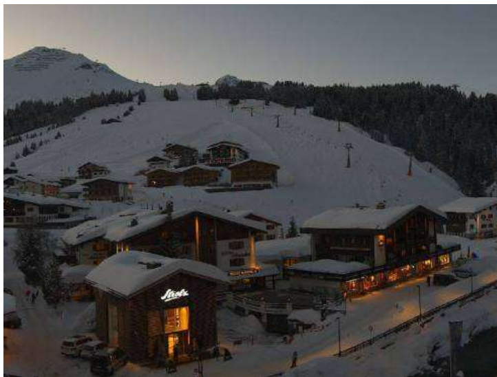
Cold and clear in Lech this evening – 13 February 2018

Friday will be mostly cloudy with some showers across the northern Austrian Alps (snow 1400-1700m) but drier and sunnier in the south. It will feel much milder everywhere.