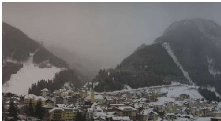
Cloudy with snow at times this afternoon in Ischgl – 16 January 2018

Wind will be a potential problem throughout the week. Expect plenty of disruption with lift closures, especially at high altitude.