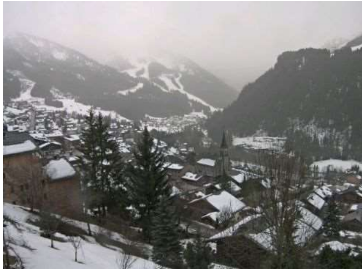
A mixture of rain and snow in Châtel today, but tomorrow it will all be snow – 16 January 2018 – Photo: chatel.com

Note that wind will be a potential problem throughout the week. Expect plenty of disruption with lift closures, especially at high altitude.