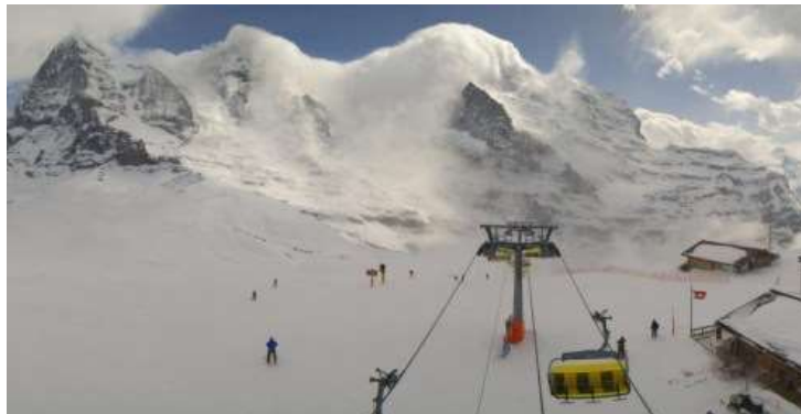
Foehn-induced cloud formations in the Bernese Oberland – 9 January 2018

Thursday will see further showers (snow 800m) close to the northern fringes of the Alps otherwise most places will be dry with sunny spells.