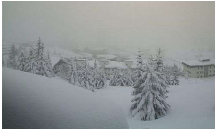
Heavy snowfall easing this morning in Sestriere – 9 January 2018

Thursday should also remain dry with sunny spells and freezing levels between 1000m and 1500m.