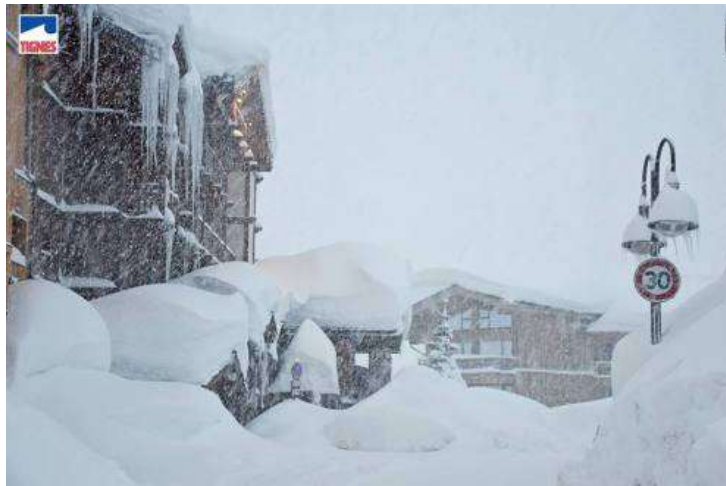
Huge overnight snowfalls in Tignes – 9 January 2018 – Photo: facebook.com/Tignes

Got a burning question about weather or snow conditions in the Alps?