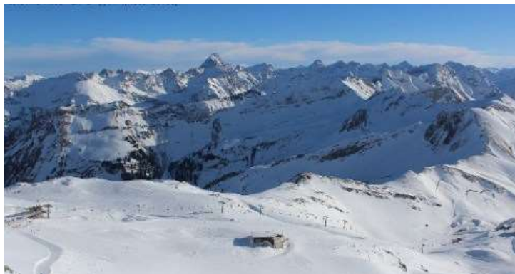
Sunny skies on the German-Austrian border today. This is Oberstdorf – 9 January 2018 – Photo: oberstdorf.com

Thursday will be cooler with rather more in the way of cloud with the odd shower in the eastern Austrian Alps (snow 800m). Further west it will be mostly dry with some sunny spells.