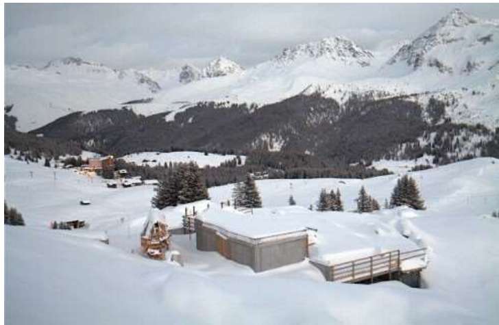
Cloudy skies this afternoon in Arosa in eastern Switzerland – 2 January 2018