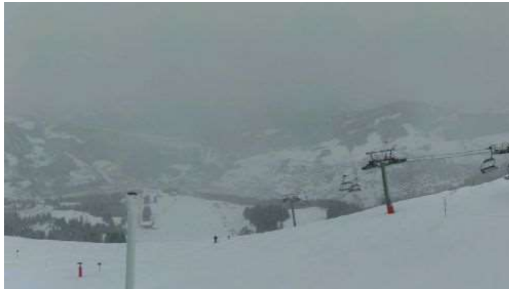
Light snow starting up again in La Clusaz late this afternoon – 2 January 2018

Thursday will be very wet and increasingly mild again with the rain/snow limit rising to between 2000m and 2300m. The far south may again see little or no precipitation.