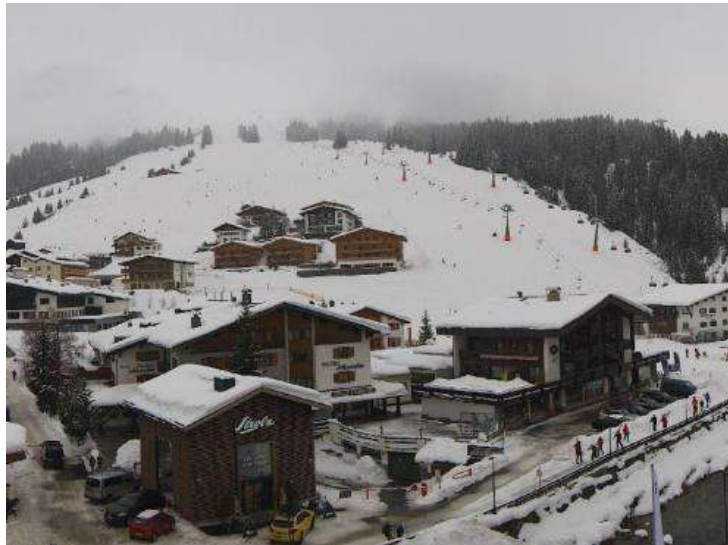
Some wet snow in Lech today but the sun should return tomorrow – 22 December 2017

Sunday and Monday will be mostly sunny above any low level cloud/mist. It will feel much milder, especially at altitude, with freezing levels close to 3000m.