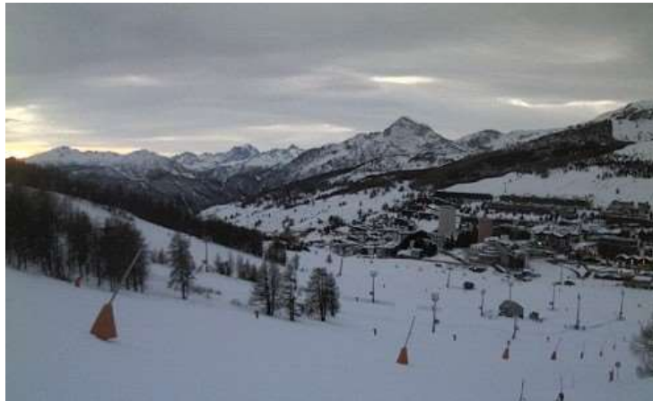
Partly cloudy in Sestriere today but it should be a glorious weekend – 22 December 2017

It will remain fine on Sunday and Monday with freezing levels around 3000m in all parts.