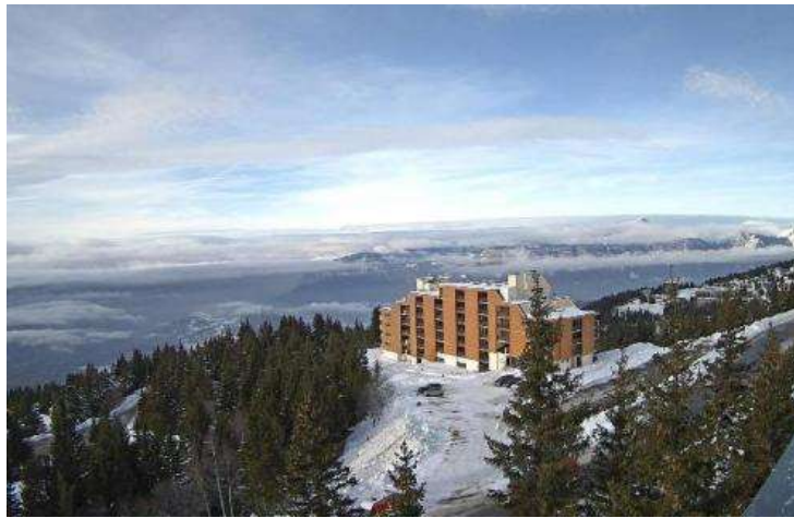
Bright and increasingly mild today in Chamrousse near Grenoble – 22 December 2017