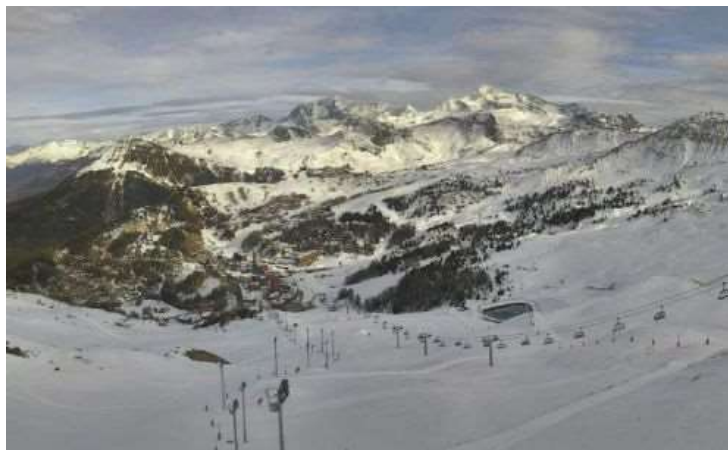
Still bright over La Plagne this afternoon but it will snow tomorrow – 24 November 2017