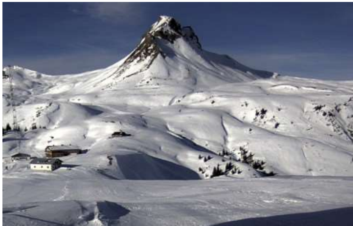
Fine weather in the Austrian Vorarlberg today but snow is expected this weekend. This is Damüls – 24 November 2017

On Monday there may still be a few flurries (600-800m) in the northern Austrian Alps but most places will be dry, with the best of any sunshine in the south.