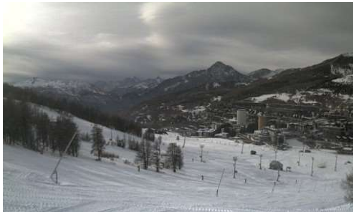
Changeable skies over Sestriere but any snowfall this weekend is expected to remain light – 24 November 2017

It will remain mostly fine on Monday with temperatures recovering a fraction, but still relatively cold for the time of year.