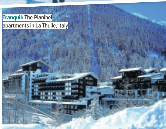
Tranquil: The Planibel apartments in La Thuile, Italy