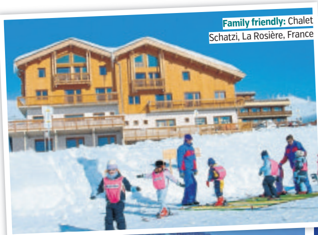
Family friendly: Chalet Schatzi, La Rosière, France