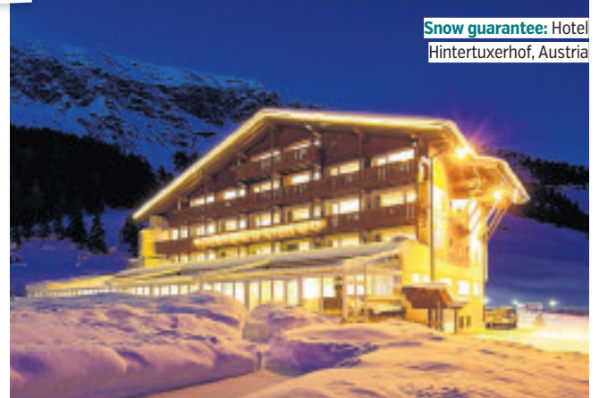
Snow guarantee: Hotel Hintertuxerhof, Austria