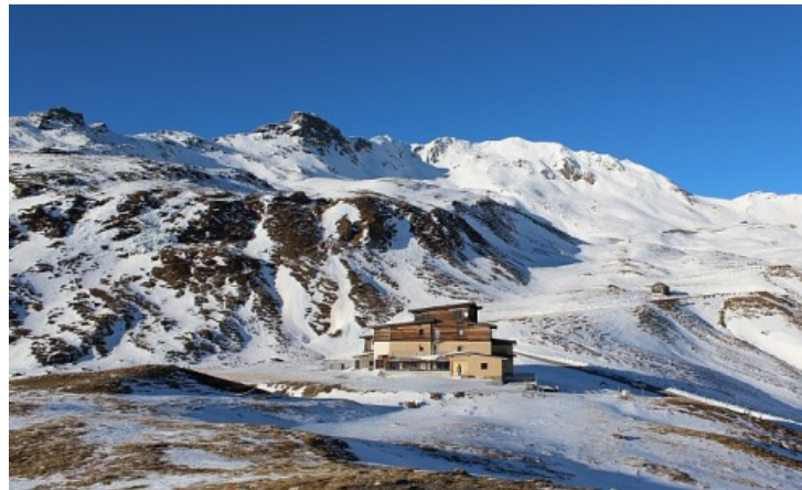
Deep blue skies in Austria this afternoon. This is the Heiligenblut area – 6 December 2016

Wednesday, Thursday and Friday will be dry with lots of sunshine above any patchy low-lying cloud/fog. Freezing levels will rise from between 2300m and 2700m on Wednesday to 3000m or higher in most places towards the end of the week.