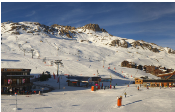
Good snow and perfect weather in Tignes today – 6 December 2016