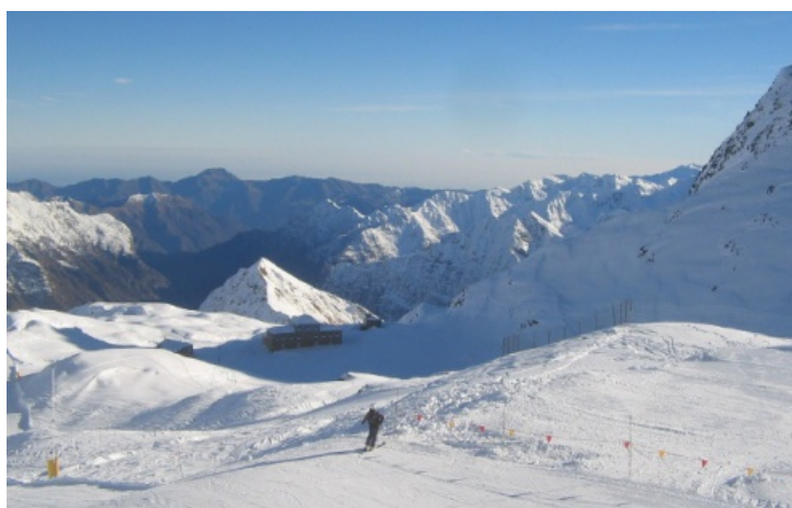
Glorious weather in Italy's Monte Rosa region – 6 December 2016 – Photo: monterosa-ski.com

Wednesday, Thursday and Friday will be dry with lots of sunshine across the Italian Alps. Freezing levels will rise to reach or exceed 3000m as the week progresses.