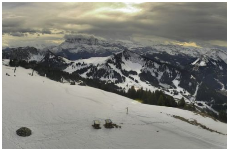
Classic Foehny skies above Châtel today - 22 November 2016