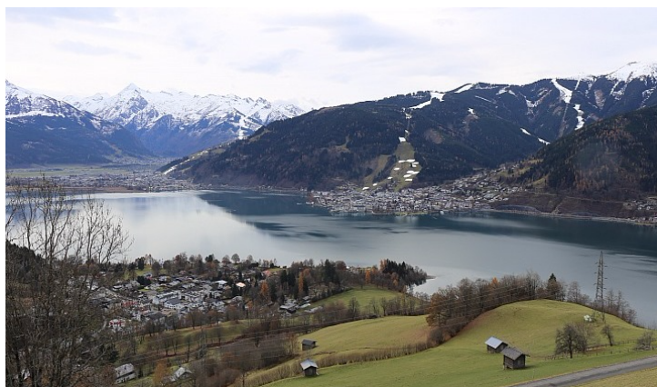
Green again in Zell-am-See – 22 November 2016 – Photo: zellamsee-kaprun.at

It will be very mild everywhere, especially in the north where freezing levels will surpass 3000m. Afternoon temperatures could reach 20°C in some Foehn-prone valleys.