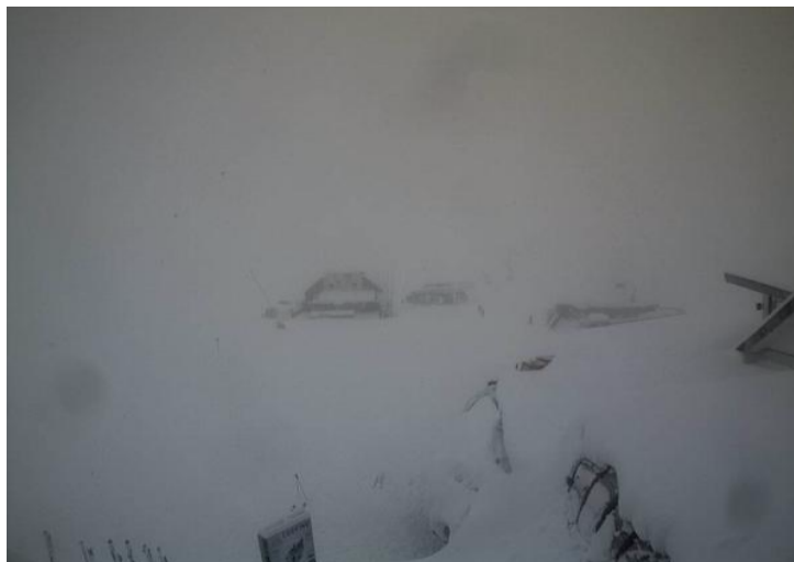
Whiteout conditions in Cervinia - 22 November 2016

Thursday will be broadly similar, but with precipitation in the north-western Alps perhaps becoming heavier and more widespread. The rain/snow line should also start to drop below 2000m.