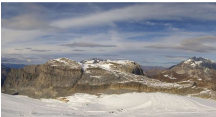
Clouds beginning to invade the ski above Tignes this afternoon heralding a major change in the weather for this weekend - 4 November 2016

Monday will see further flurries, mostly in the northern French Alps, with a rain/snow limit around 500-800m.