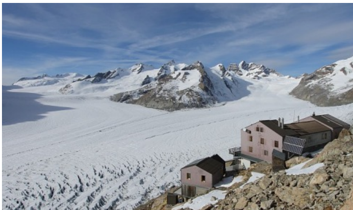
Glorious sunshine in the Aletsch region of Switzerland today, but lots of snow is forecast here this weekend - 4 November 2016 - Photo: foto-webcam.eu

Monday will see further showers (snow to 400-700m) mostly in the northern half of the Swiss Alps with the best of any brightness further south.