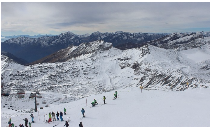
Benign weather conditions on the Mölltal glacier today, but lots of snow expected is here on Sunday - 4 November 2016