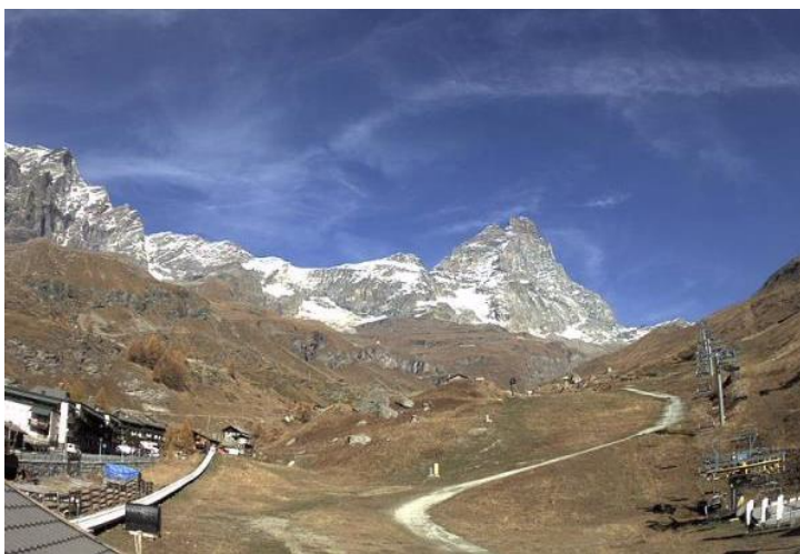
Lovely autumn day in Cervinia, but the weekend weather will be very different - 4 November 2016