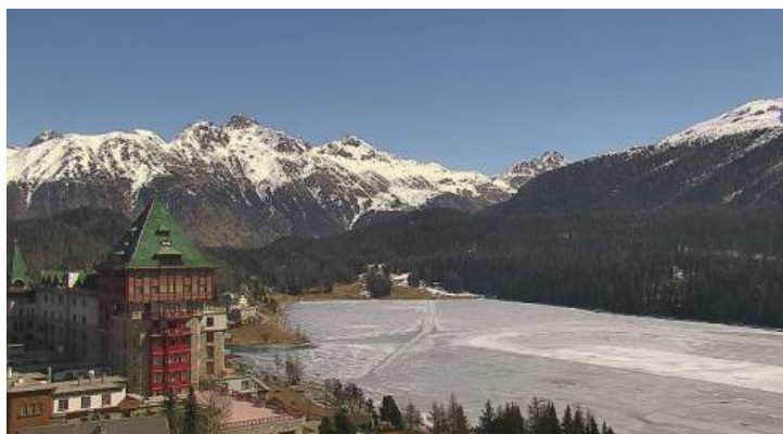
Feeling spring-like today in St Moritz – 27 March 2017

Further north, and lower down generally, snow conditions are more mixed with spring in full swing and only patchy natural cover at low altitudes. You can still find some enjoyable piste skiing in the likes of Wengen (0/80cm) and Nendaz (5/210cm), but the hard early pistes are turning slushy by early afternoon – even earlier on slopes directly exposed to the sun.