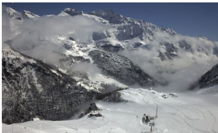
Plenty of new snow at altitude in the Monte Rosa region. This is Gressoney – 27 March 2017

Expect lots of warm and sunny weather this week, with a rapid loss of any low-lying new snow in the west.