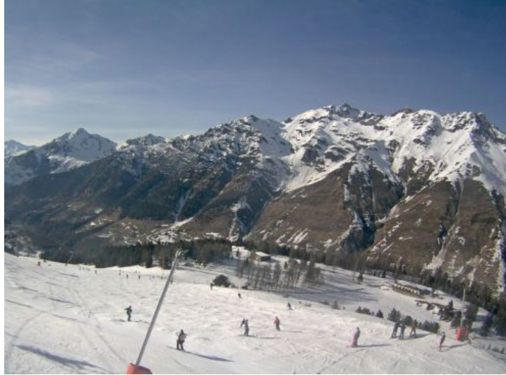
Good late season skiing in the higher parts of the Pyrenees. This is Grand Tourmalet – 27 March 2017 – Photo: grand-tourmalet.com

It is still possible to ski in Scotland, despite the patchy cover, with 10/25cm now in Cairngorm .