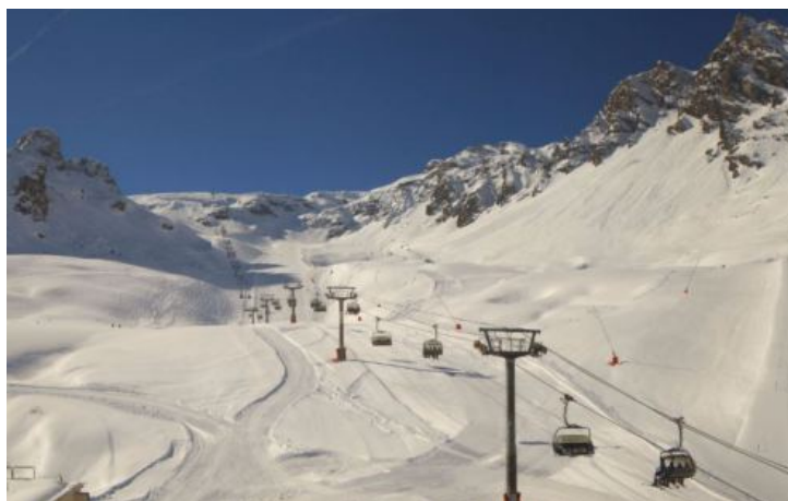
Near perfect snow conditions in Tignes today – 27 March 2017 – Photo: tignes.net