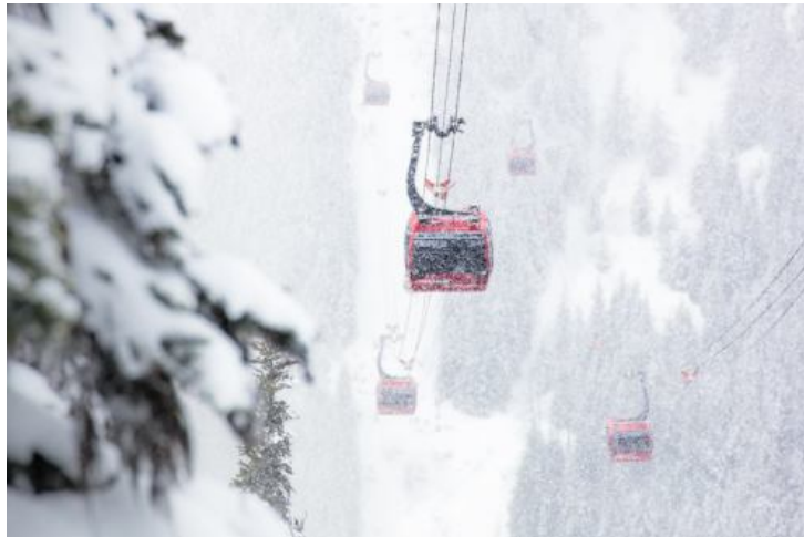
It doesn't seem to stop snowing in Whistler this March – 27 March 2017 – Photo: facebook.com/whistlerblackcomb

Further east, there hasn't been as much fresh snow but you can still find some excellent skiing in the likes of Revelstoke (283cm upper base).