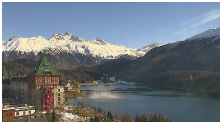
Beautiful winter scene in St Moritz – 28 November 2016

Saas-Fee (20/120cm), Grimentz (20/50cm), St Moritz (5/50cm) and Engelberg (0/20cm) are some of just a number of more limited options, open thanks to their high altitude slopes. Generally speaking, however, snow cover is still patchy or non-existent at low altitudes.