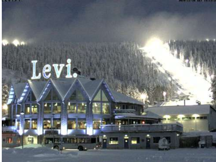
Looking wintry in Levi, Finland – 28 November 2016

In Scotland, some skiing was possible in Cairngorm on Friday but since then the snow cover has deteriorated again.