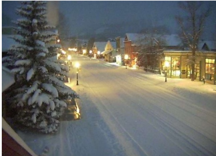
New snow in Crested Butte, Colorado – 28 November 2016 – Photo: skicb.com

It has also been snowing in Colorado, where Breckenridge (45cm upper base) has seen 23cm of new snow and also has seven trails open. It is also very cold, and will remain so for some time to come.