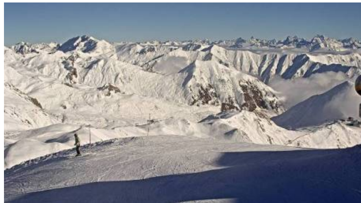
Good piste skiing up high in Ischgl – 28 November 2016 – Photo: ischgl.com

Of the entirely non-glacial resorts, Ischgl (0/40cm) offers an impressive 117km of runs, the most in Austria for the time being. There are several other options though, including Obertauern (30/60cm) with around 70km of runs and Obergurgl (0/35cm), where 17 lifts are now open despite the modest snow cover.