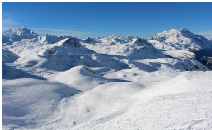
Masses of snow at altitude in Val d'Isère – 28 November 2016 – Photo: facebook.com/valdisere