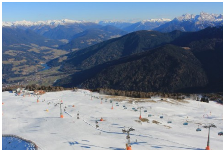
Surprisingly extensive piste skiing available in Kronplatz, on a mixture of natural and man-made snow – 28 November 2016 – Photo: kronplatz.com

Further east, Kronplatz (20/40cm) is another great option, with 54 runs open on a mixture of natural and man-made snow. A handful of other runs are also open across the Super-Dolomiti area, including in Cortina (0/25cm), albeit on a very limited basis.