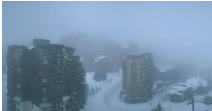
Snowing this morning in Avoriaz - Photo: avoriaz.com