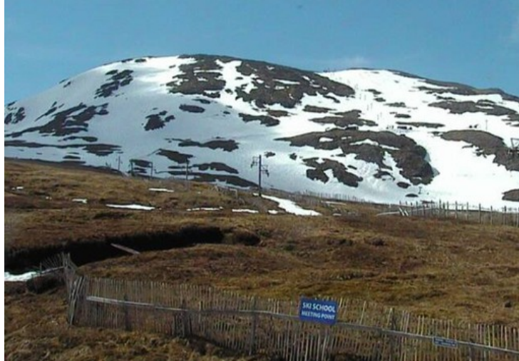
Glencoe remains the best bet in Scotland

In the Pyrenees, Cauterets (180/280cm) is one of a very few areas still offering any snow sports, while Scotland is now down to two resorts - Glencoe (10/150cm) and Cairngorm (0/40cm) - the former by far the better bet.