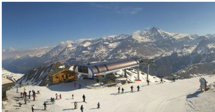
Tignes remains one of the best bets in France right now - Photo: tignes.net