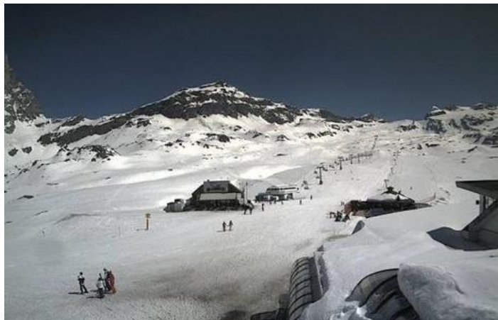
Cervinia currently offers the most extensive skiing in Italy

A little fresh snow is expected above 1800m in the Dolomites today with more widespread wintry showers forecast for later in the weekend.