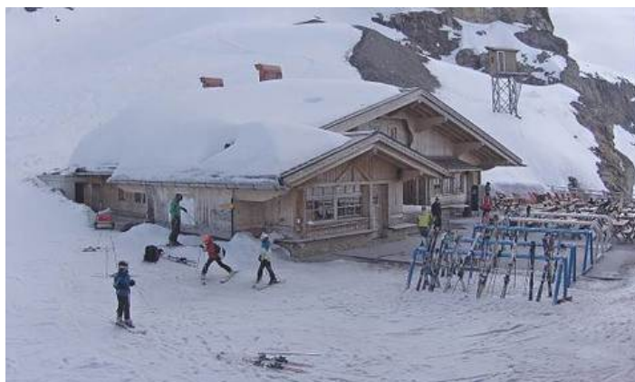
Excellent snow cover remains at altitude in Engelberg

The weather will turn very unsettled over the weekend and early next week with snow to increasingly low levels.