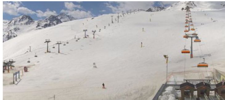
Decent skiing still possible at altitude in Sölden

Most of today's fresh snow will be in the south-east (e.g. Mölltal glacier ) but more widespread snow is forecast later in the weekend and early next week.