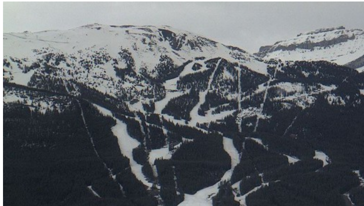
Plenty of snow remains in the Banff/Lake Louise area, despite relatively warm weather this week

Many resorts have now closed but Whistler (174cm upper mountain) struggles on, despite patchy lower snow cover. Better conditions can be found inland in the Banff/Lake Louise area (180cm upper mountain).