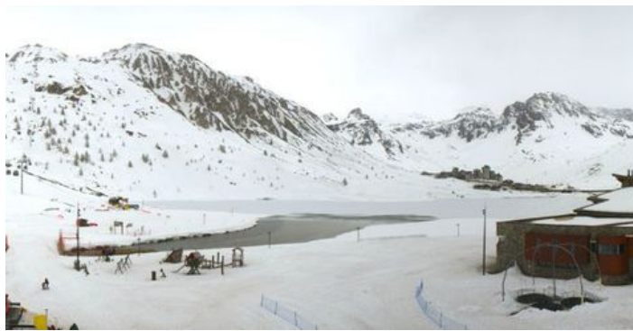
Good snow cover still in Tignes