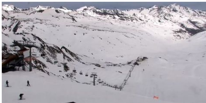
The Val Senales glacier is one of only a handful of Italian ski areas still open

After a spell of fine and very warm weather this week, it will turn cooler over the next few days with a little snow here and there at altitude.