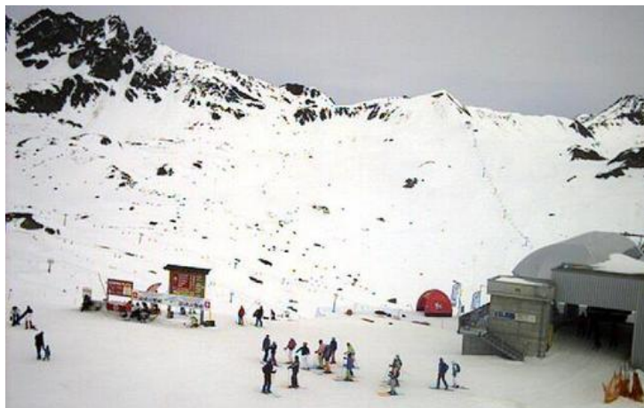
Good skiing still available in the Samnaun/Ischgl area

After the recent warm and sunny run of weather it will turn colder over the next few days with some fresh snow expected at altitude.