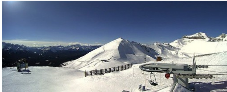
Plenty of good skiing still available in the Banff/Lake Louise area - Photo: skilouise.com

Conditions are better further inland, where Lake Louise has 169cm mid-mountain.