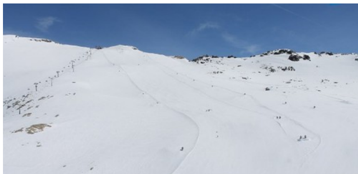
Still mostly sunny today in Austria. This is the Mölltal glacier

After a warm and mostly sunny week, cooler cloudier conditions are forecast over the weekend with wintry showers to relatively low levels.