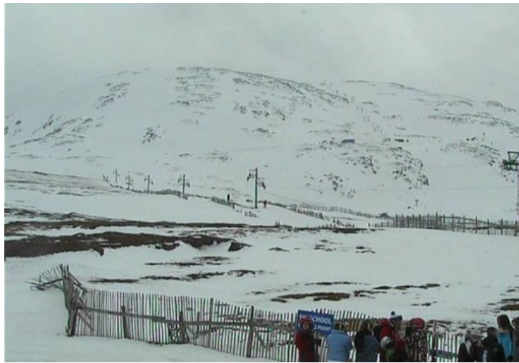
Still plenty of snow at altitude in Glencoe (Scotland) - Photo: winterhighland.com