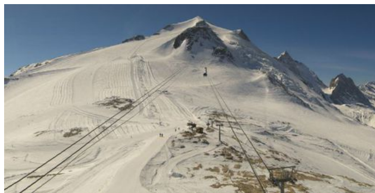
Bluebird in L'Espace Killy today. This is Tignes

Generally speaking, the best snow conditions are in resorts with plenty of skiing above 2000m such as Val d'Isère (100/160cm), with a greater emphasis on spring snow lower down in resorts such as Megève (60/120cm).