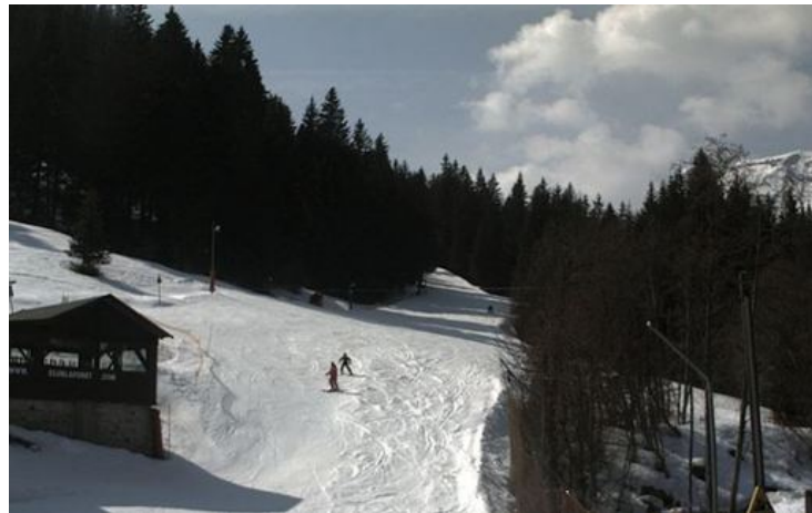
Fine weather but variable snow conditions in the Portes du Soleil. This is Morgins

Lower down, spring conditions are more in evidence in the likes of Villars (35/130cm) and Wengen (10/110cm), but that is to be entirely expected as we move into late March.