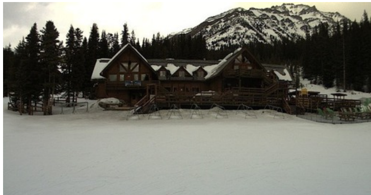
Good snow cover still in the Banff/Lake Louise area

As ever this season, the interior offers more consistent conditions, with fresh snow in Banff where the upper snow base is now 167cm deep.