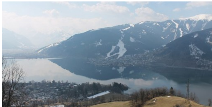
Spring has sprung in the lower Austrian valleys. This is Zell-am-See

For more consistent snow conditions you need to aim for resorts with plenty of skiing over 2000m, such as Obergurgl (25/160cm) or Ischgl (10/100cm).