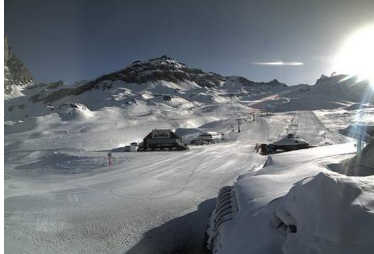
Perfect conditions at altitude in Cervinia today

By contrast, the lower resorts of the east haven't seen any major dump for quite some time, with spring firmly in control – in the lower valleys at least. Val Gardena (10/100cm) still has plenty of on-piste skiing on offer, but is looking increasingly green at low altitudes.