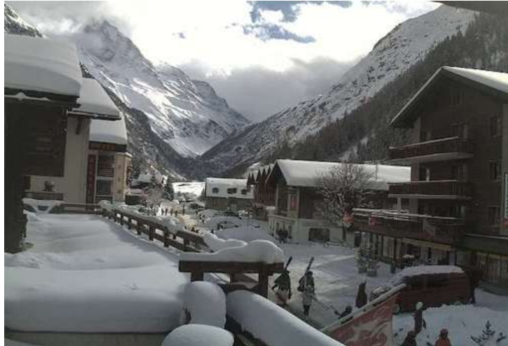
Excellent snow conditions across Switzerland at the moment. This is Zinal - Photo: valdanniviers.ch

With temperatures remaining low, it goes without saying that snow conditions will be fantastic this week, but extreme caution is still needed off-piste where there have been a number of fatalities in recent days.