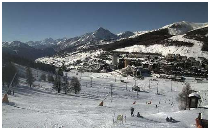
Less snow in most Italian resorts than on the northern side of the Alps, but good pistes nevertheless in Sestriere - Photo: vialattea.ch

Generally speaking though, 10-20cm was more the norm, which has freshened things up in the likes of Selva (20/100cm) and Sauze d'Oulx (60/80cm) even if conditions remain less spectacular here than on the northern side of the Alps.