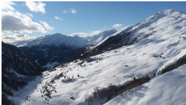
Beautiful weather in the southern Austrian Alps this afternoon. This is Astental

Lech (110/280cm) in the far west has some of the deepest powder right now but, with temperatures remaining frigid, conditions are also excellent in low resorts such as Kitzbühel (55/80cm) and Söll (75/95cm).