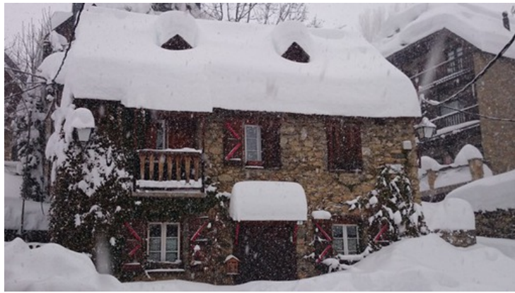
Massive snowfalls in the Pyrenees. This is Baqueira Beret in Spain