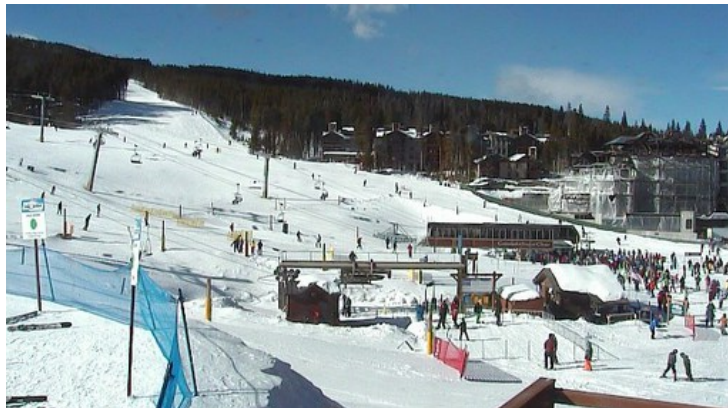
Excellent piste skiing still in Breckenridge, Colorado - Photo: breckenridge.com

It's a similar story in Wyoming and Utah where Jackson Hole (193cm) and Alta (163cm) have seen bits and pieces of snow, but no significant dump for a while.