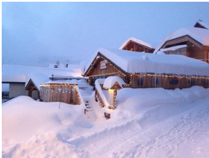
Huge snow depths in the western French Alps right now. This is Alpe d'Huez - Photo: facebook.com/alpe.huez