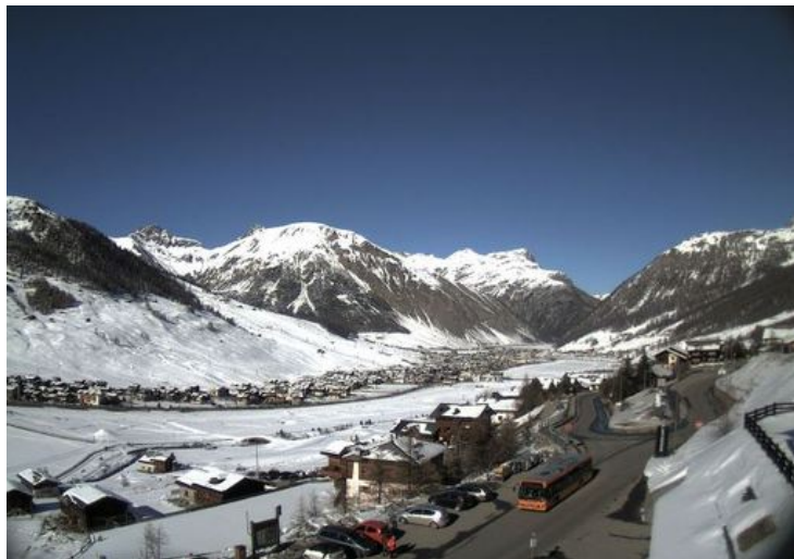
Last day of clear blue skies for a while in Livigno - Photo: valtline.it

Monday will be dry with variable cloud in the central and eastern Italian Alps, but cloudier conditions with showers will move into the west. It will be temporarily milder with any snow above 1200-1400m, dropping later.