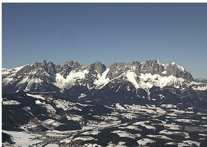
Perfect blue skies in Kitzbühel this afternoon

Monday should be mostly dry with sunny spells.