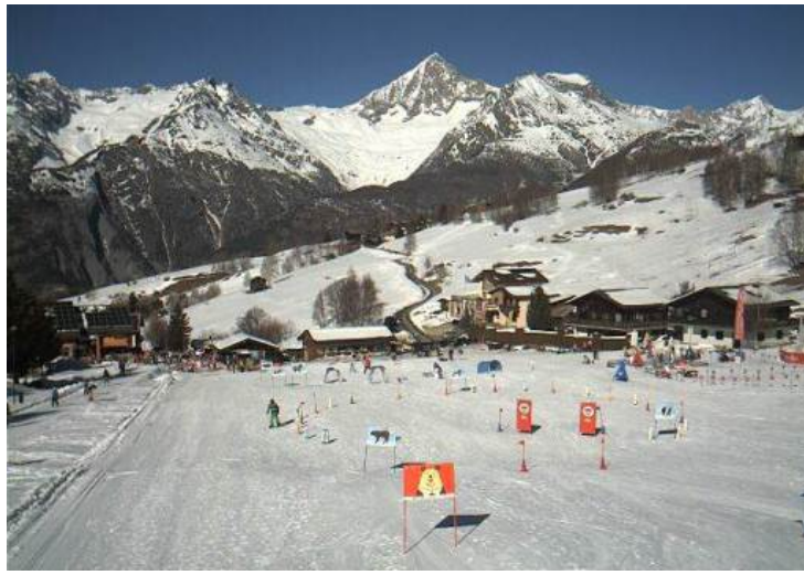
Final day of a day of fabulous spring weather in Bürchen in the Valais