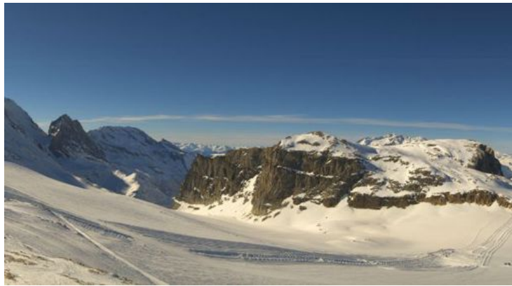
First signs of cloud moving in from the west on the horizon. This is the view from the Grande Motte glacier, Tignes