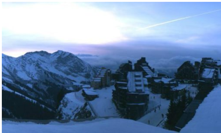
The calm before the storm in Avoriaz, which could see one of the biggest snowfall totals in the Alps tomorrow