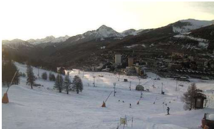
Generally speaking, the Italian Alps will see more modest accumulations of snow. This is Sestriere

Monday should be mostly dry but still very cold with sunny spells.