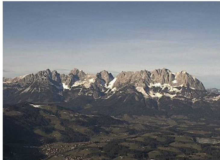
Sunny skies this afternoon in Kitzbühel

Monday is likely to be cloudier with scattered showers and a little snow above 1500m here and there, most likely in the south and west (Carinthia, Tirol).