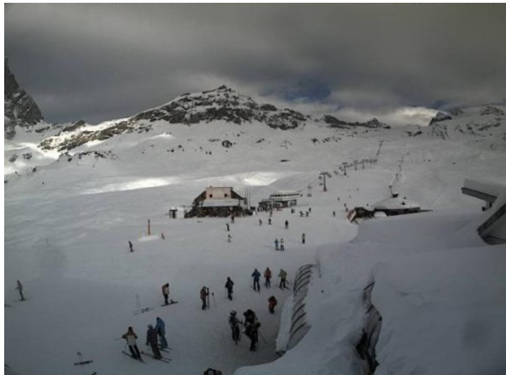
It hasn't snowed for a while in Cervinia, but conditions are still very good

It will remain changeable on Monday with further mostly light rain or snow (1500m) in the central and eastern Italian Alps, but mostly dry with isolated showers further west.