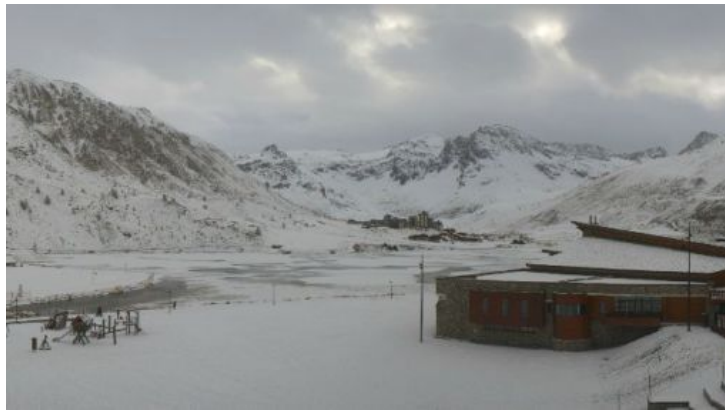
Changeable looking skies above Tignes, a theme that will continue over the next few days, but without any serious snow