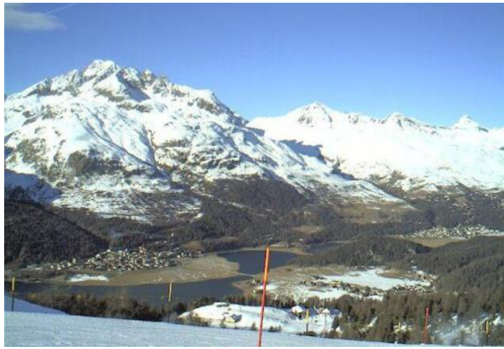
View from the bottom of the Corvatsch near St Moritz this afternoon