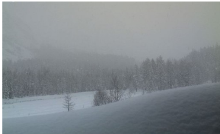
Big snowfalls in Courmayeur this morning, with more to come over the weekend

There will be plenty more snow falling across the Italian Alps this weekend , both west and east with a rain/snow limit between 800 and 1200m.