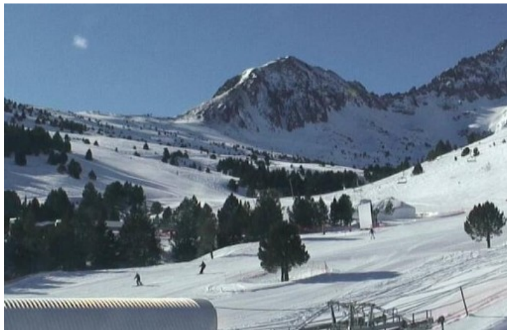
Sun and snow in Soldeu (Andorra) so far this week.

Most Norwegian resorts also have fresh snow, with some of the heaviest falls in the resorts around Lillehammer (90/120cm) where conditions are excellent at all levels.