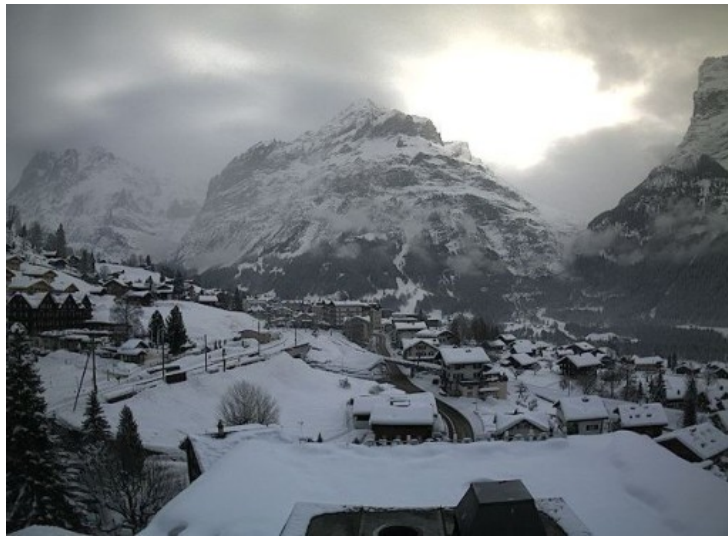
A dusting of fresh snow in Grindelwald this morning.