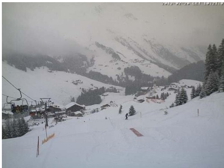
Fresh snow in the Austrian Vorarlberg this morning. This is Warth-Schröcken

The southern Austrian Alps have missed the latest round of snow but conditions in resorts such as Nassfeld (80/210cm), close to the Italian/Slovenian border, are still very good.