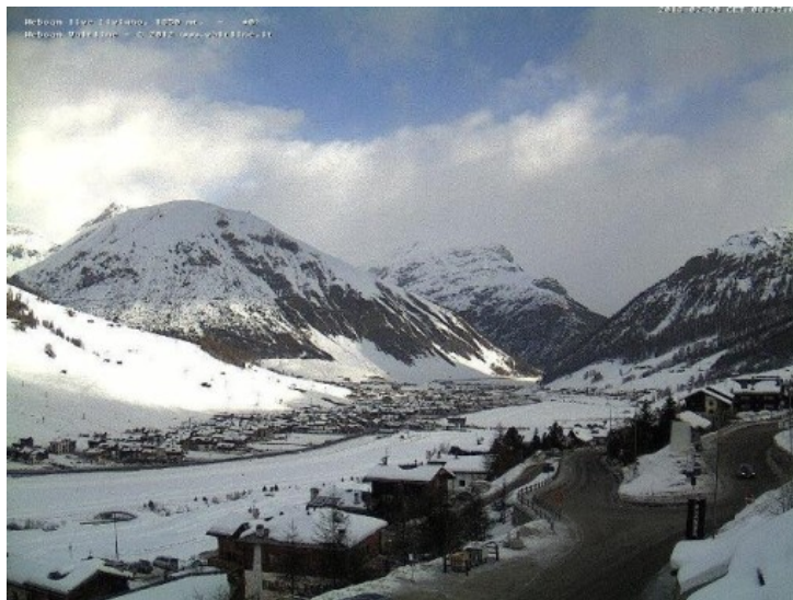
Reasonably bright in Livigno this morning, but the odd snow flurry is possible later

Further east, the Dolomite resort of Madonna di Campiglio (60/150cm) is also skiing well, and here some big snowfalls are expected over the weekend – especially Sunday.