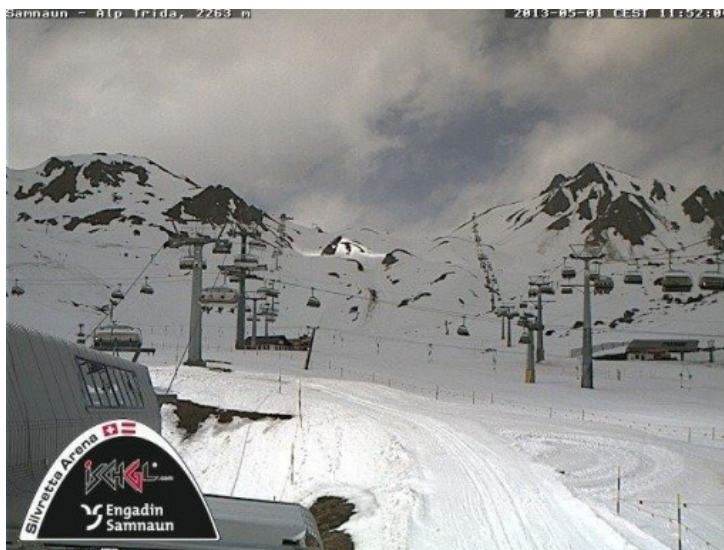
Last day of the season today in Ischgl

There hasn't been much in the way of fresh snow this week, but Austrian resorts have (until now) had better weather than many resorts further west. The rest of the week will be more unsettled, so be prepared for some showers if you are skiing on the glaciers in the next few days – particularly in the afternoons. It will become cooler too, with the rain/snow limit dropping from 2700m to 2000m or so by the weekend.