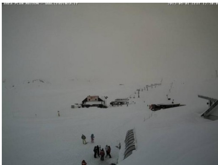
Lots of fresh snow at altitude in Cervinia which closes on 5 May

Elsewhere in Italy, Livigno and Cortina close today, Val Senales on Sunday. The Presana glacier near Passo Tonale is reported to be staying open until 8 June.