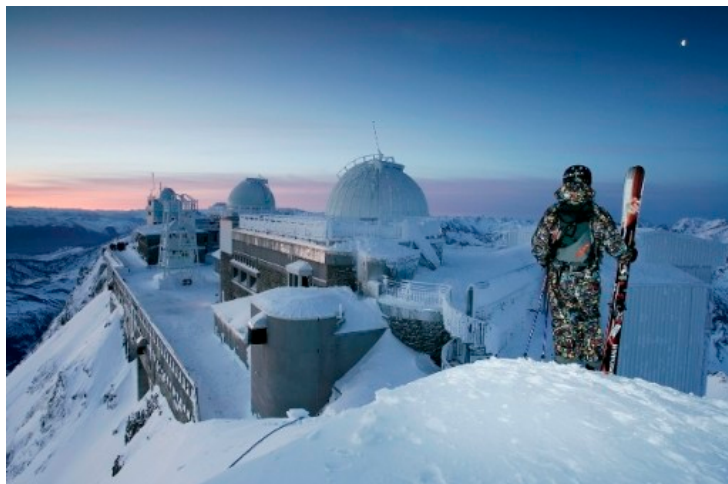
The Pic du Midi will reopen 6-12 May for off-piste skiing only.

In Scandinavia, most major resorts are now closed or are closing today (including Åre and Hemsedal ).