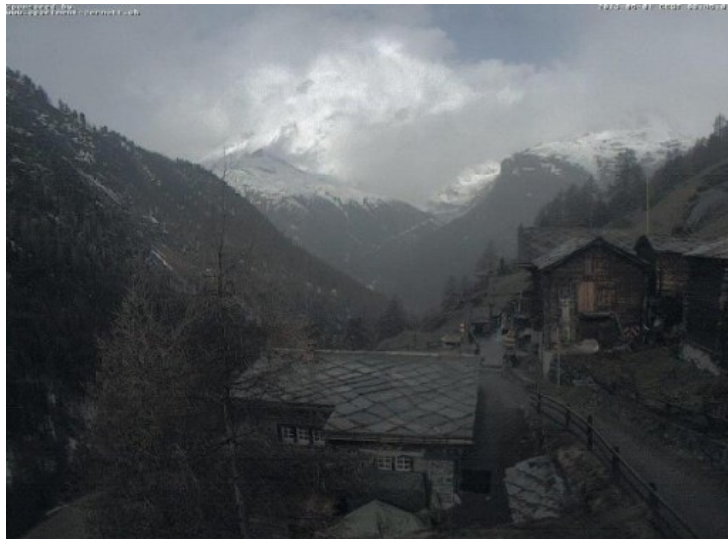
Lots of rain in Zermatt this week means lots of snow on the glacier - Photo: www.apartment-zermatt.ch