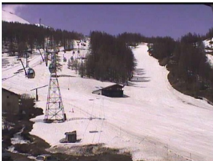
Still ample cover down to La Daille, the lowest point in Val d'Isère. The lifts here close on Sunday - Photo: www.valdisere.com