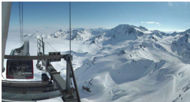
Great skiing is still possible in Val Thorens - open til 12 May - Photo: www.valthorens.com