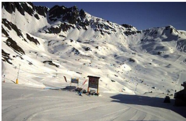
Good snow cover at altitude in Ischgl.

Either way, spring conditions rule - with hard-packed runs early on, softening up as the day progresses.