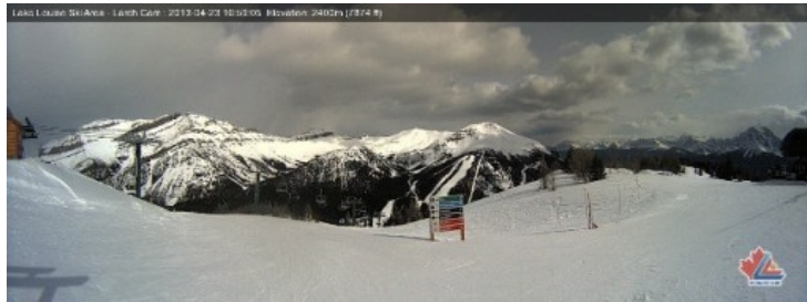
Banff/Lake Louise is one of the few remaining options available in western Canada

Most Canadian resorts are now closed for the season. However, you can still ski in Whistler (192cm mid-mountain) where new snow is expected this weekend. Banff/Lake Louise (209cm) is the other main option and is in great shape for the time of year.