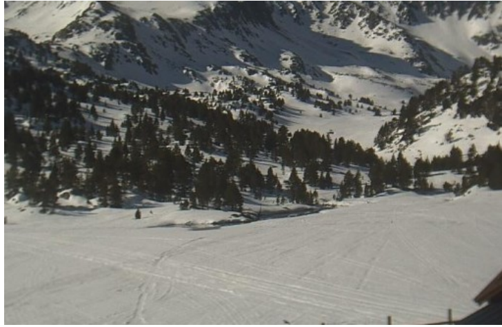
Good snow cover still in the Grandvalira in Andorra.