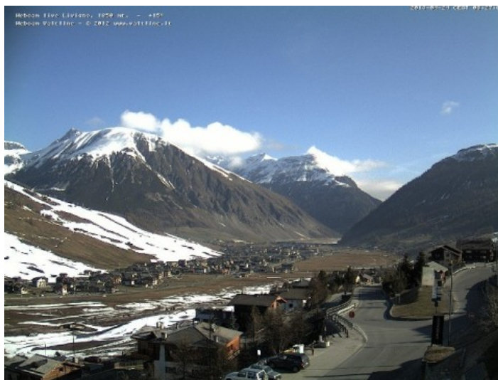
Looking a bit spring-like in Livigno right now, but there is still plenty of snow left on north-facing slopes

Options are now very limited in Italy. By far the most extensive and snow-sure skiing right now is in Cervinia (0-320cm) where the sheer height means that there is plenty of good snow to be found, particularly up top. Livigno (5/236cm) and Passo Tonale (80/400cm) are other options, but neither have the same extent of high altitude slopes as Cervinia .