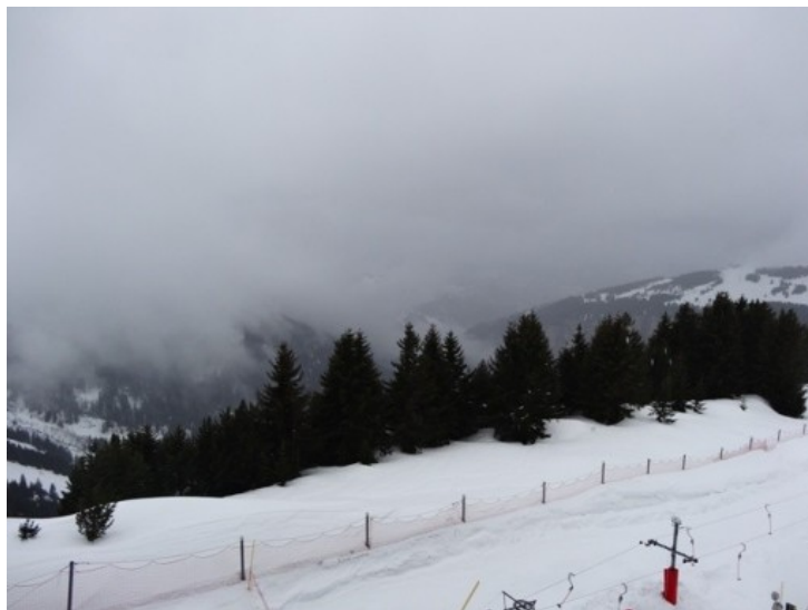
Impressive snow depths still in Avoriaz, despite rain today