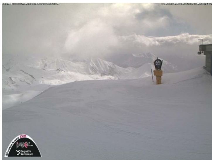
Ischgl is a good choice if you're still looking to ski this April

Many low Austrian resorts have now closed for the season but higher up there is still plenty of good skiing to be had. Obertauern (210/250cm) is one option, but Obergurgl (70/187cm) is even better right now due to the superior altitude of its slopes. Ischgl (0/130cm) is another resort worth considering for a very late trip, as it usually offers the greatest extent of very late skiing in Austria and will stay open until 1 May.