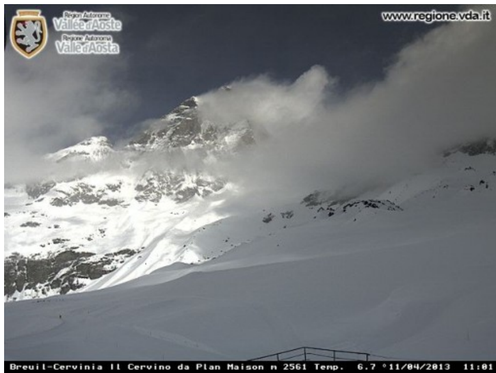
Excellent snow quality still at altitude in Cervinia

Many resorts are now finished for the season, but there is still some great skiing to be had in the higher parts of the Italian Alps. Cervinia (25/310cm) is always the best option for a very late season trip and still offers wintry conditions right now on its upper slopes. Glaciers aside, another good option is Livigno (15/230cm).