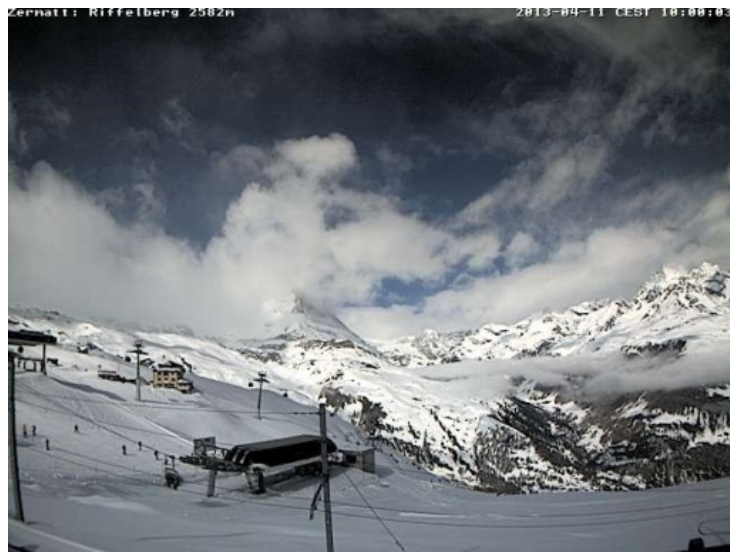
Zermatt is one of the best resorts for a late season ski trip