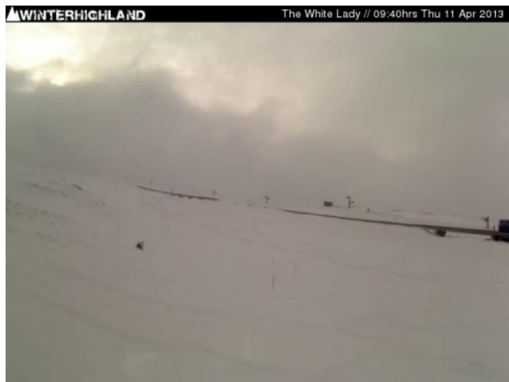
Incredible snow cover this spring across all Scottish ski resorts. This is Cairngorm.

Most Pyrenean resorts (including those in Andorra) are closed or will close this weekend despite ample snow cover. There are plenty of options still available in Scandinavia where Åre (Sweden, 60/104cm) and Hemsedal (Norway, 75/120cm) both have good cover and offer decent spring skiing. Don't forget Scotland, too, where all 5 resorts are open and snow depths are extraordinary for the time of year – 255cm, for example, on the upper slopes of Glencoe .