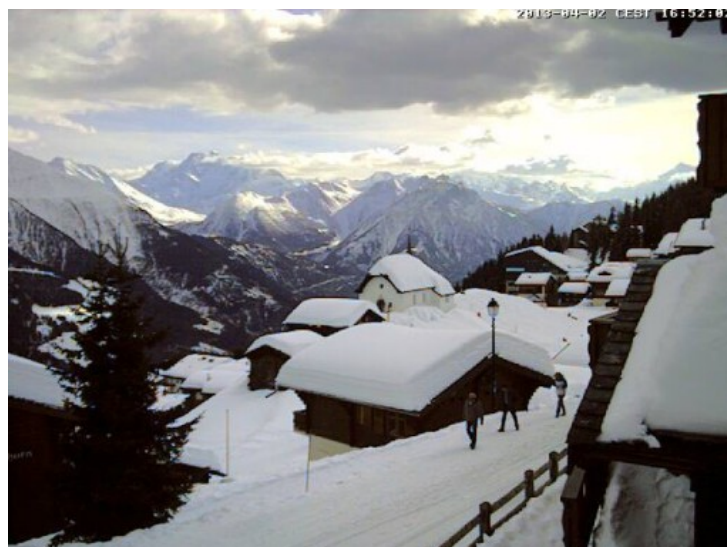
Impressive snow cover still in Bettmeralp

Snow cover is exceptional for early April, particularly in the west where the likes of Verbier (75/275cm) and Zinal (50/160cm) are in great shape, particularly at altitude. Only in the south-east are snow depths close to average, but the snow quality remains excellent in St Moritz (15/150cm) thanks to the relatively low temperatures which are forecast to continue all week.