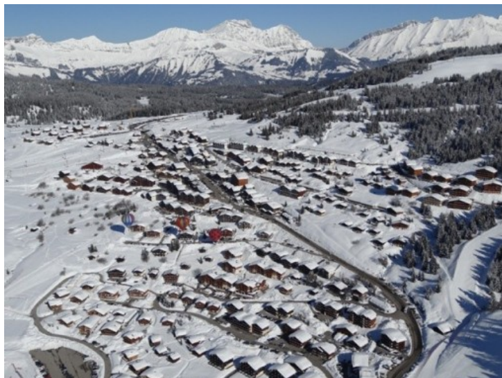
Fantastic snow cover in Les Saisies

Conditions are excellent for the time of year, especially at altitude, where resorts such as Tignes (150/320cm) and Val Thorens (165/365cm) are reporting near perfect pistes today (Tuesday). WeatherToski is in Les Saisies (191/226cm) right now where most of the skiing is below 2000m, and even here the snow is remaining firm for most of the day, at least on north-facing slopes.