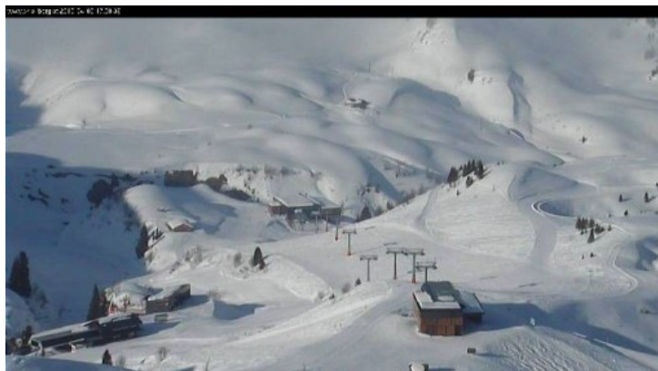
No sign of spring yet in Lech

The lower valleys are now a bit green but there is still some good piste skiing to be had in Söll (50/120cm), which is now in its last week of the season. The most consistent snow quality, however, is in the higher resorts such as Obergurgl (70/180cm) and Ischgl (30/150cm) both of which are in prime shape and will remain open until May.