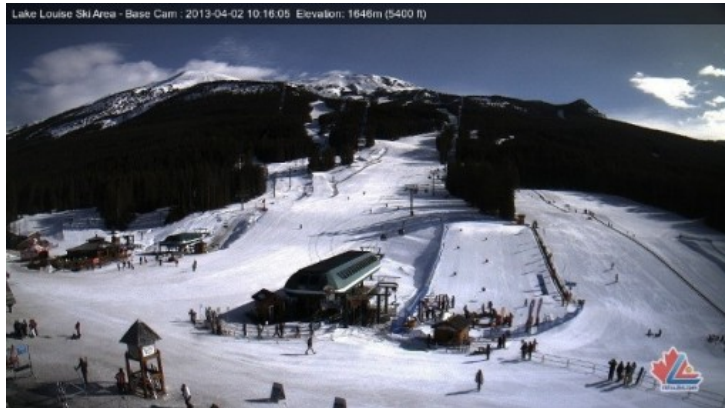
Good skiing continues in Lake Louise despite no significant snow for a while

Most western Canadian resorts haven't seen any significant snow in a while but, on-piste at least, conditions remain pretty good in both Whistler and Fernie where the upper mountain bases are 240/270cm respectively.