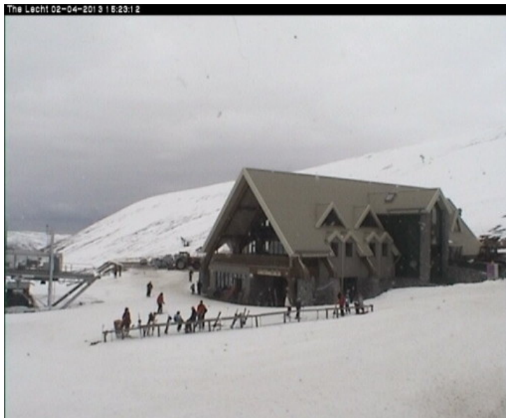
Unusually good snow cover in Scotland this Easter. This is the Lecht,