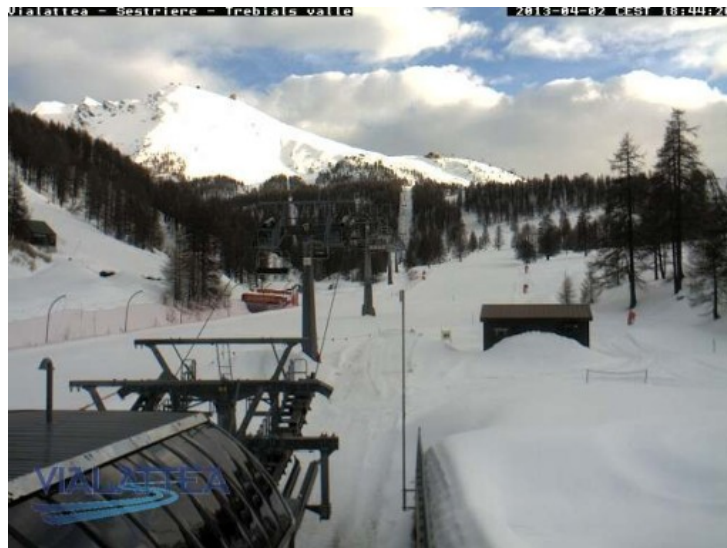
Good skiing today in Sestriere - Photo: www.vialattea.it

Snow conditions remain good for April thanks to the relatively low temperatures. For the most consistent snow conditions aim for higher resorts such as Cervinia (45/320cm) or Passo Tonale (90/400cm). However, even lower resorts such as Sauze d'Oulx (100/140cm) and Selva (50/170cm) are offering some excellent piste skiing, particularly early in the day and/or on north-facing slopes.